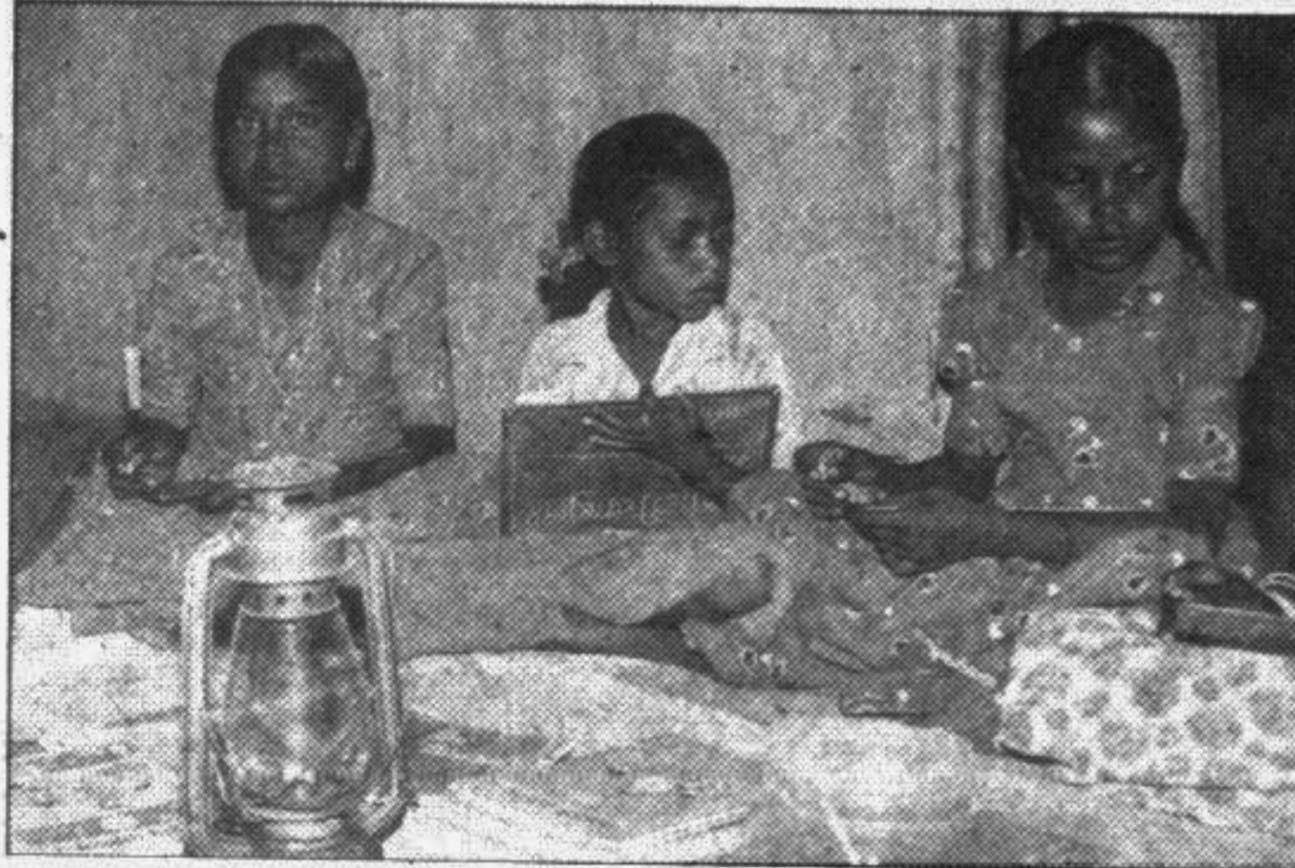
Every child should have the right to education