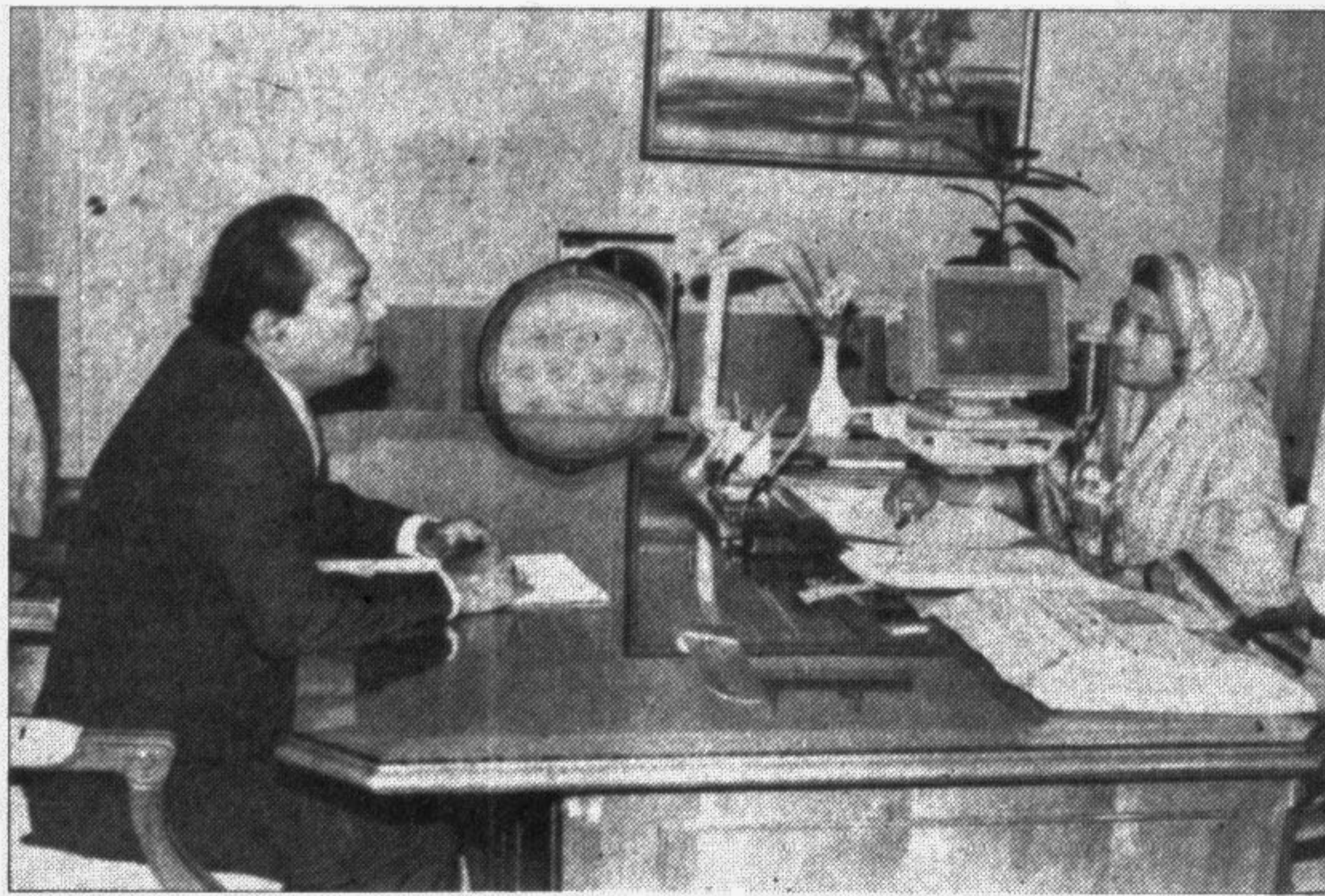
Chief Election Commissioner Md Abu Hena called on Prime Minister Sheikh Hasina at her office yesterday.

that so many people are given so much inconvenience by them hardly seems to bother these men. Dustbins overflowing with garbage is a common picture but that shouldn't interfere with our daily lives. Instead of this, the picture we often see is that the garbage pouring out of the enclosed gap of the bin like an avalanche, hitting the streets and occupying some part of it. What's more intolerable is that many dustbins are actually set up right at the sides of the road, when they should be in a quiet and remote corner, away from all the hustle and bustle. These trashes, that are basically inimical substances, not only block space but are actually unhealthy for the people nearby, not to mention the fact that they pollute the atmosphere. Therefore, as roads are strictly intended for vehicles, such unwanted interferences should not be encouraged as it is simply improper and inexcusable. Since every object is built with a definite purpose, so all things must follow their own course and rule. Because otherwise a lot of things tend to be miscait and mislead.