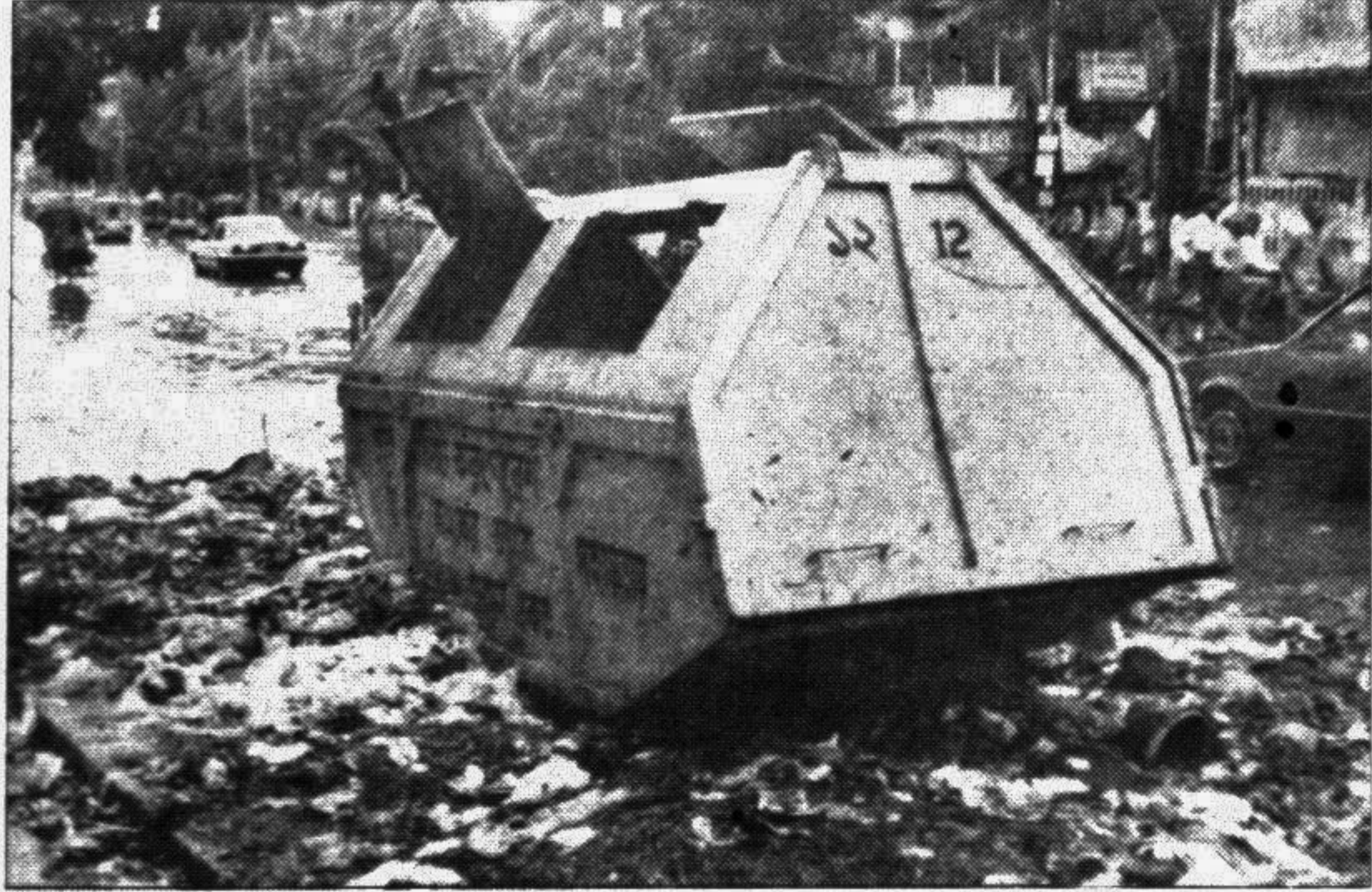
The dustbin is meant for what it is not.