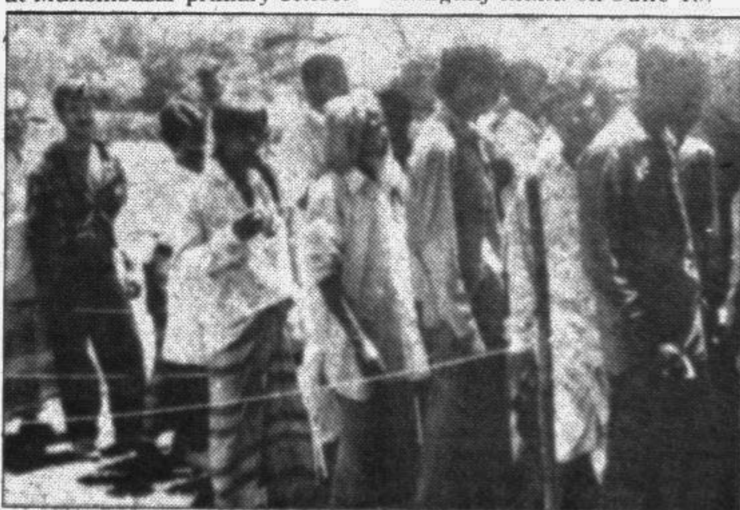
SYLHET: People queuing up at a polling centre at Gowainghat thana during the repolling on June 19.

centre on June 19. Seven out of 11 lost their security deposits in this constituency.