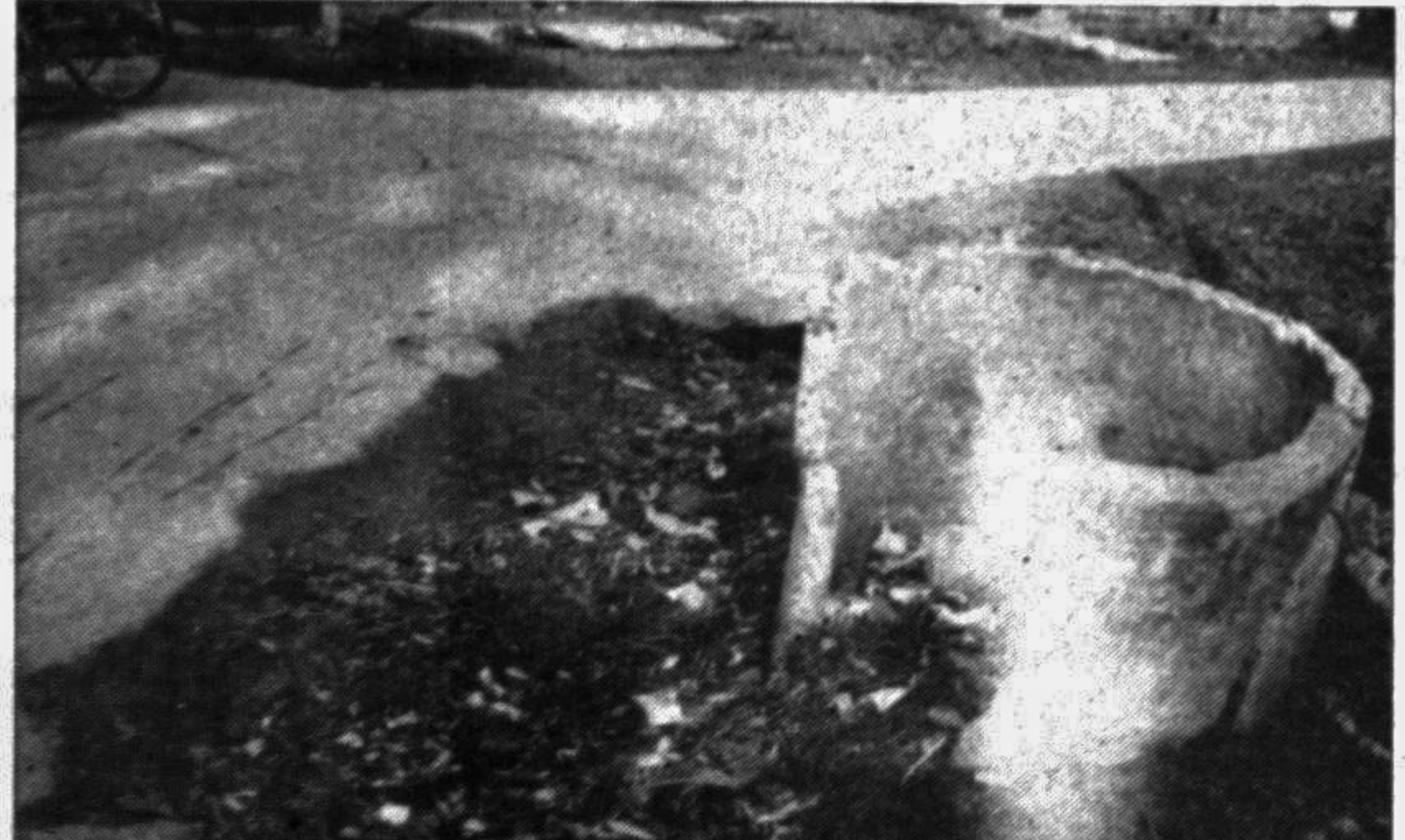
PABNA: Condition of a dustbin in Salgaria area of the town.

problem to the poura dwellers as construction of new houses are not properly planned with the future modernization of the pourashava. And the pourashava authority to quiet indifferent with the matter. The people of Gopalganj pourashava have been bearing the burden of excess poura taxes in comparison with that of Madaripur and Faridpur pourashavas in contravention of the government rules and regulations. The poura people are deprived of minimum civic facilities and the pourashava authority has no initiative to provide with the same. Housing poses a great