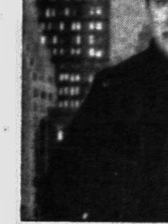
NYPD Blue on Star Plus, Tonight at 9:30