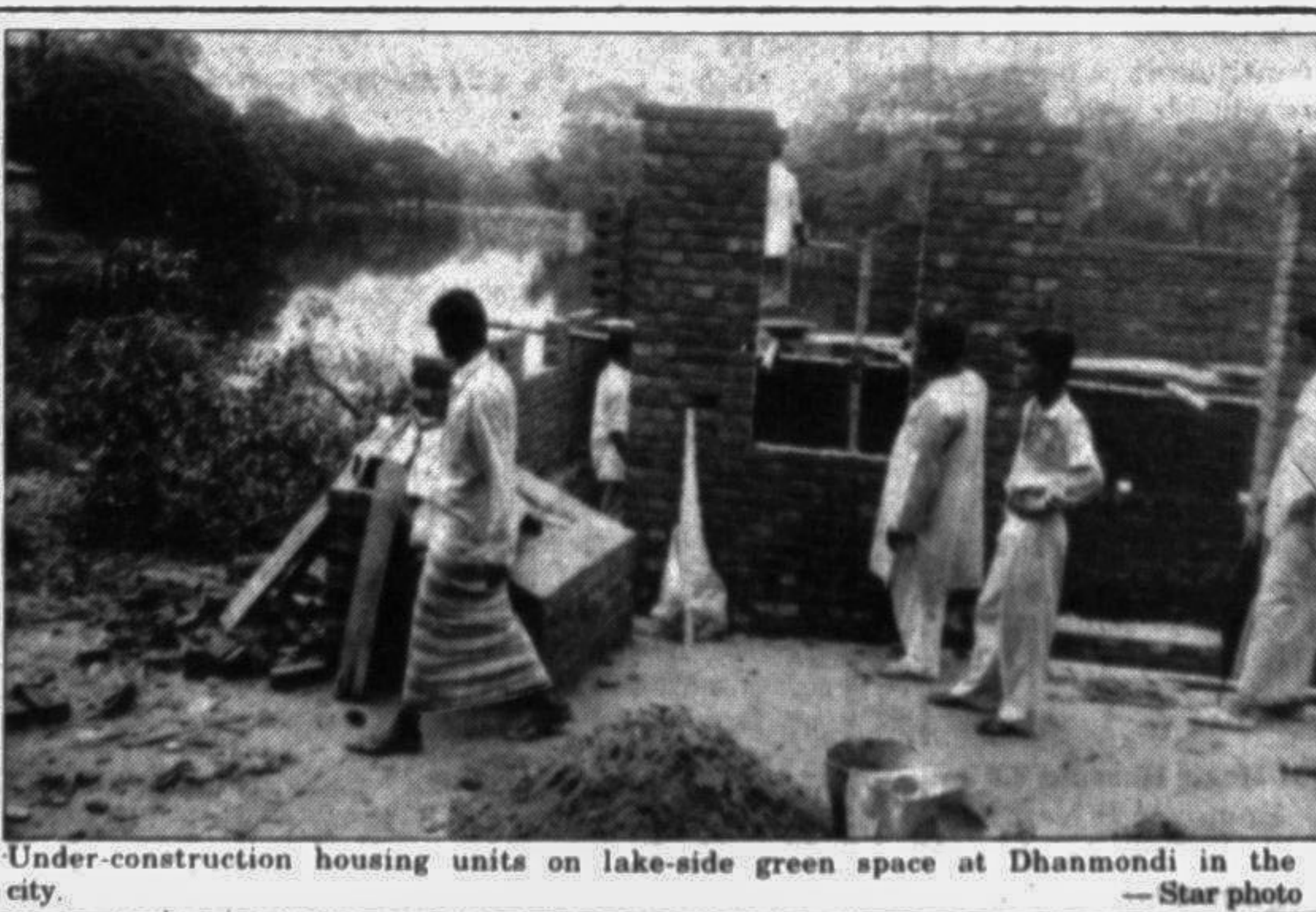
Under-construction housing units on lake-side green space at Dhanmondi in the city.

A resident of Road No. 15 said, "Look at the condition of other parts of the lake and its green space. Some officials of the PWD itself is running a basti (slum) at the end of Road See Page 12 col 8