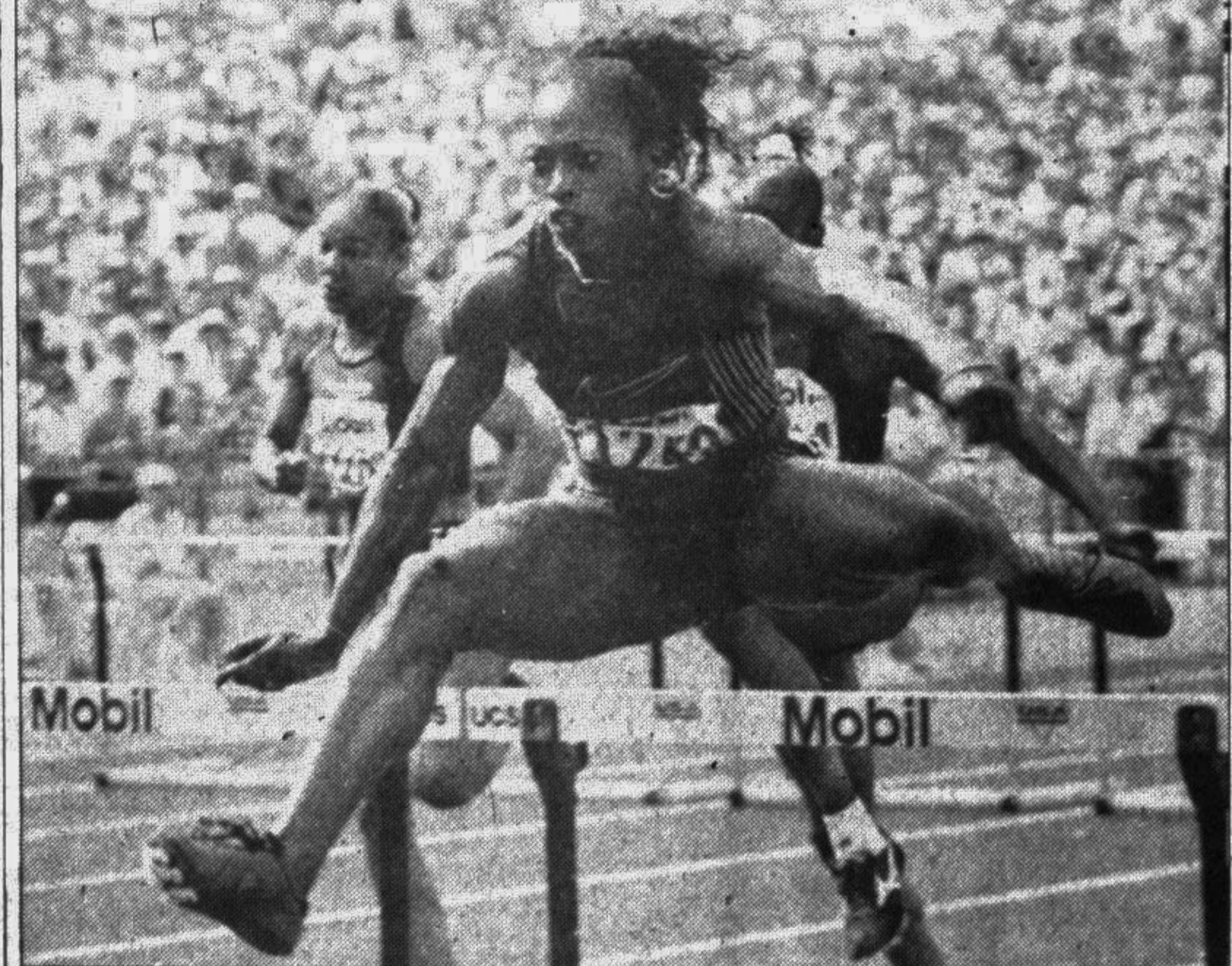
Gail Devers is in great form at the US Olympic track and field trials as she passes the last hurdle in the 200 metres in Atlanta on June 23. Devers clocked 12.62 seconds.

LONDON, June 24: A Scottish doctor warned on Sunday that England could see an increase in domestic violence if it loses its Euro '96 soccer semi-final match against Germany this week, reports Reuter.