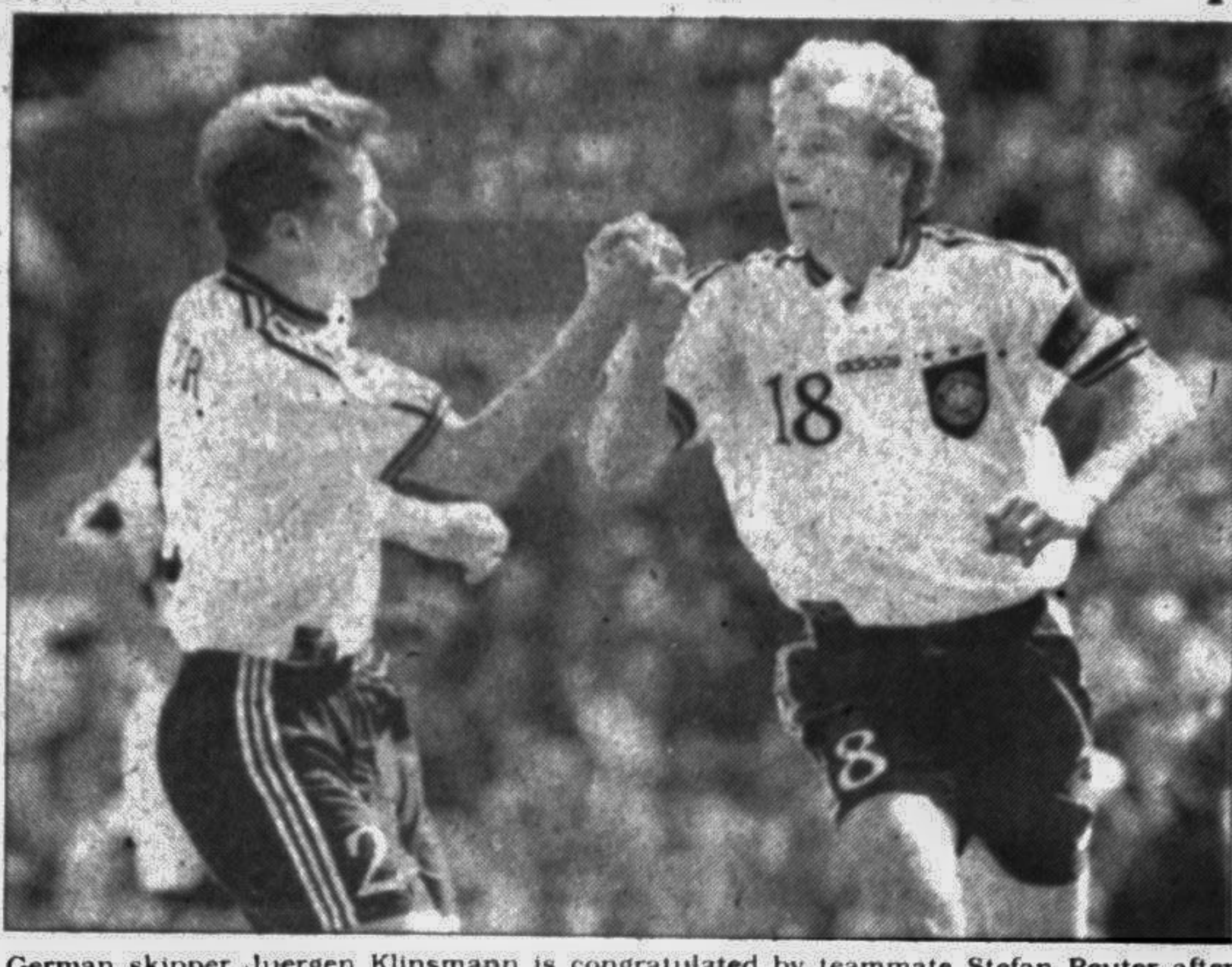
German skipper Jurgen Klinsmann is congratulated by teammate Stefan Reuter after converting a penalty to send his side one up against Croatia in their Euro '96 quarterfinal encounter at Old Trafford on Sunday. The 1990 World Cup winners won 2-1.

COLOGNE, Germany, June 24: Germany's Olympic high jump champion Heike Henkel failed on Saturday in her last chance to achieve the Olympic qualifying standard, virtually ensuring that she will not defend her title in Atlanta, reports Reuter.