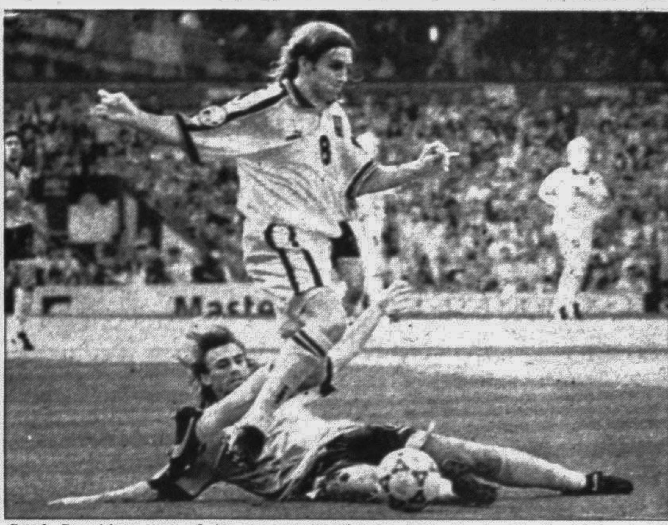
Czech Republic's man of the moment Karel Poborski is the target of a sliding tackle by Portugal's Joao Pinto during their explosive Euro '96 quarterfinal at Villa Park on June 23. Poborski scored a stunning goal to sink the entertaining Portuguese.

MARLOW, England, June 24: Franz Beckenbauer paid England midfielder Paul Gascoigne the highest compliment on Sunday when he likened him to Diego Maradona, reports Reuter.