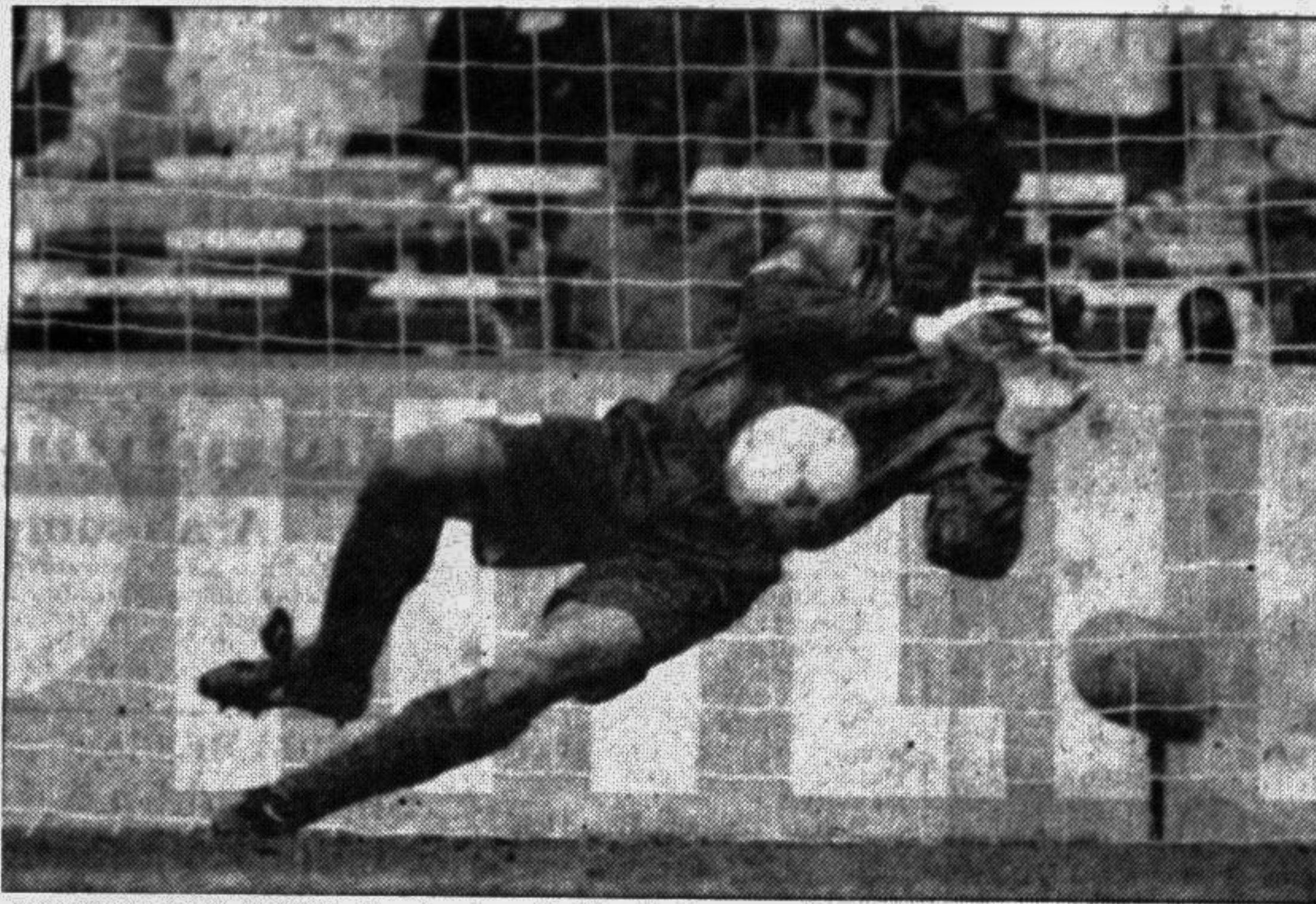
HERO OF THE NIGHT: England goalie David Seaman dives smartly to his left to snuff out Spain's Angel Nadal's spot-kick during the penalty shoot-out after their Euro '96 quarterfinal ended goalless after 120 minutes at Wembley Stadium on Saturday. England met Germany on Wednesday.

LONDON, June 23 (Reuters): Order of play on the show courts at the Wimbledon tennis championships starting Monday (prefix number denotes seeding):