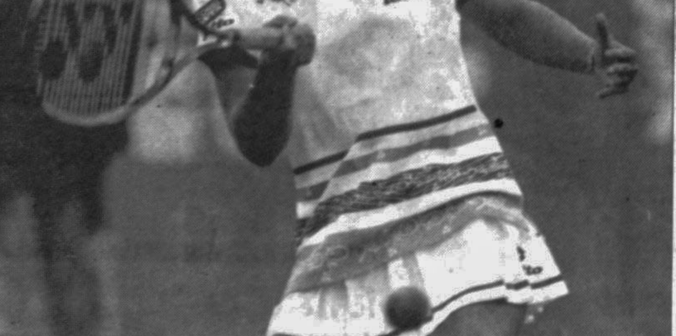
Anke Huber of Germany makes a forehand return against Czech Helena Sukova during the final of the Wilkinson tennis championship at Rosmalen, Netherlands on June 22. Huber won 6-3, 7-6.

Fernandez, who was on court for more than four hours in her quarterfinal and semi-final matches on Friday, had a brief respite when she broke in the opening game of the