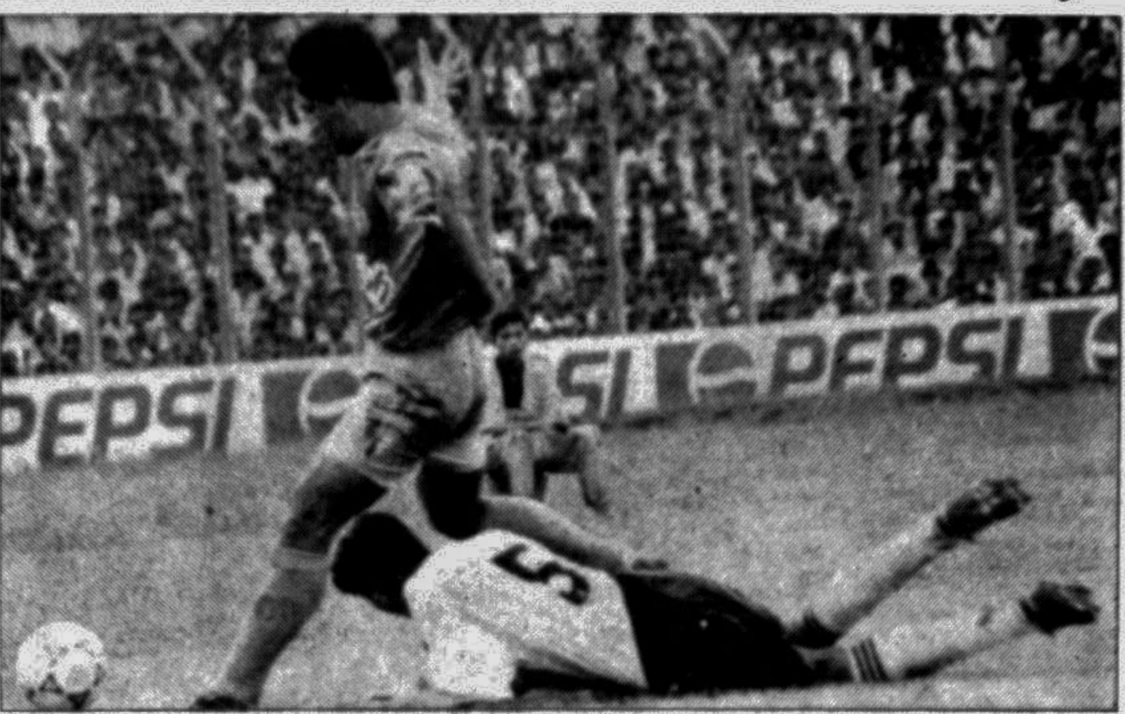
A year can make a lot of difference. Last year on June 22 Dhaka Stadium was bursting at its seams; what with the Mohammedan-Abahani Federation Cup final on. This year on the same day with still no competitive football in sight, premier division players keep busy in a practice session at the same stadium; only today it is barren.