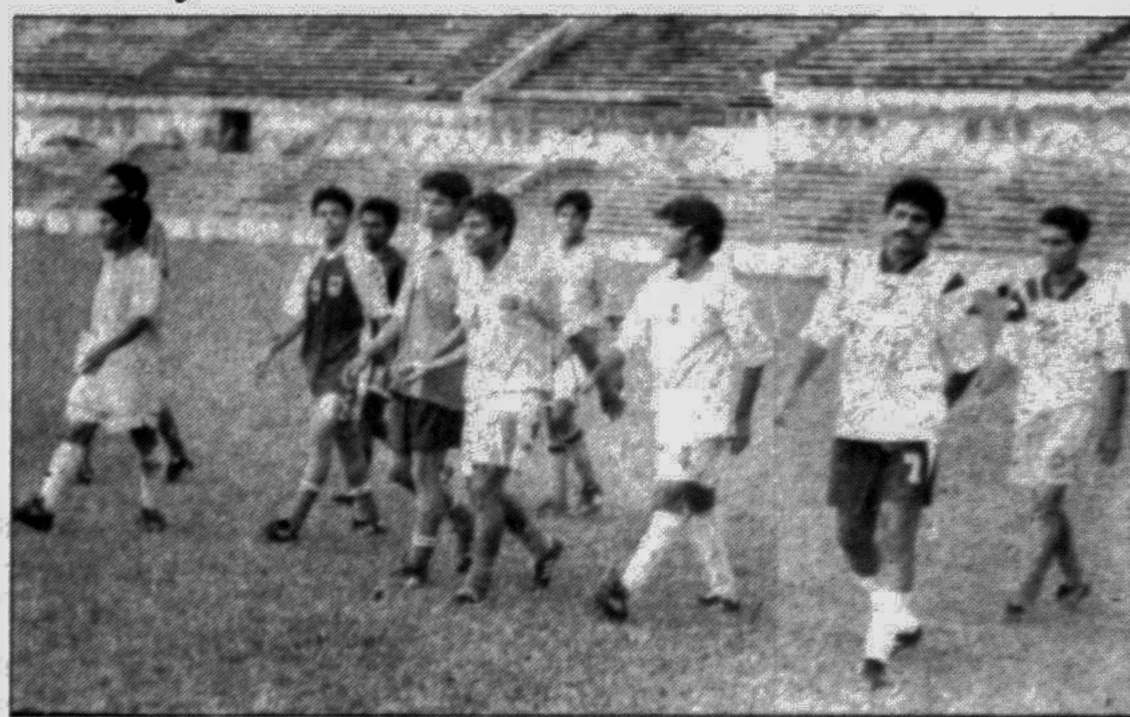
A year can make a lot of difference. Last year on June 22 Dhaka Stadium was bursting at its seams; what with the Mohammedan-Abahani Federation Cup final on. This year on the same day with still no competitive football in sight, premier division players keep busy in a practice session at the same stadium; only today it is barren.

everyone's expectations save Dutch coach Guus Hiddink. He had predicted a physical 'battle' and the number of Dutchmen deployed behind the ball constantly tested French patience.