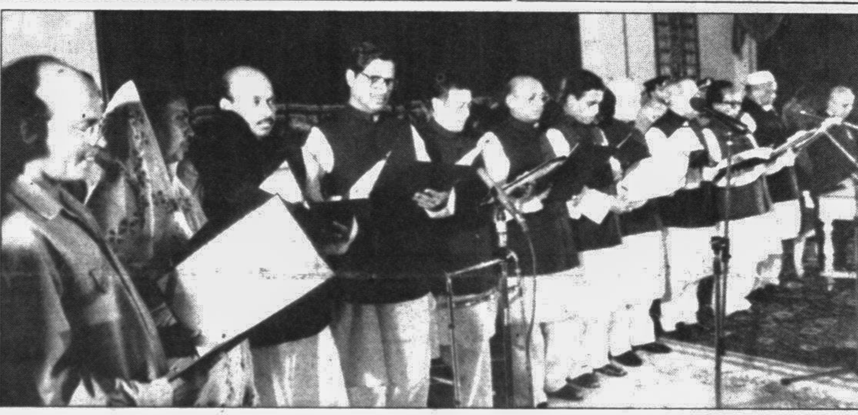
President Abdur Rahman Biswas administering oath to 11 cabinet ministers at Bangabhaban yesterday.

The MPs-elect of Bangladesh Nationalist Party (BNP) are scheduled to take oath today at 5:00 pm, according to a high official of the Jatiya Sangsad secretariat. Speaker Shaikh Razzak Ali will administer the oath at the Sangsad Bhaban. With 116 members elected to the Parliament in the June 12 general elections, the BNP has emerged as the largest ever opposition party in the Parliament. Meanwhile, sources close to the BNP high command told this correspondent yesterday that the leadership was planning to make the party an "effective" Opposition in Parliament while also thinking