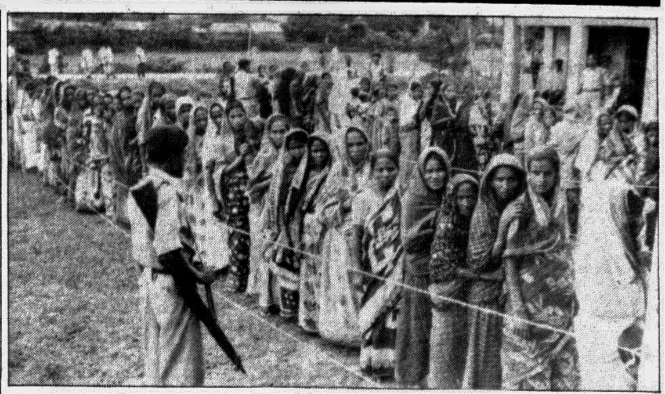
The turnout of female voters was quite high during the repolling on June 19. This photograph was taken from a centre in Comilla.

His body was sent to Satkhira Sadar Hospital for autopsy. A case has been filed with the police.