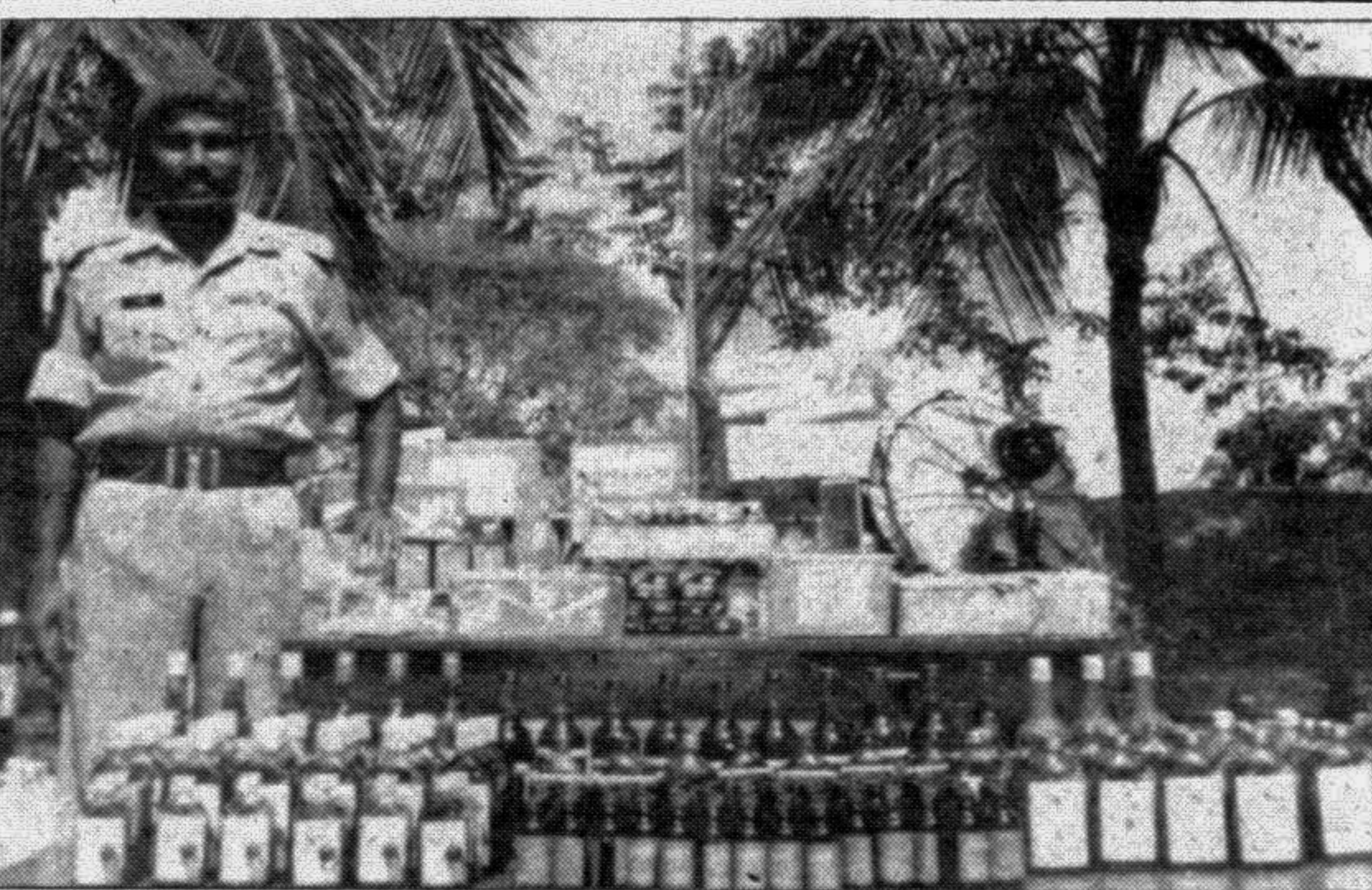
NAWABGANJ: Smuggled Indian goods worth about Tk 11 lakh were recovered by BDR from Shiganj thana recently.

Animal lovers and local leaders said that no step has been taken to stop the poaching of animals.