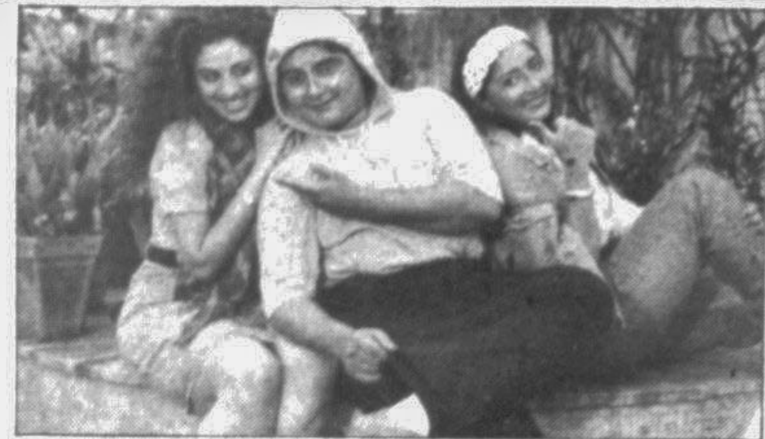
V3+ on EL TV, Tonight at 8:30

6:30am Vetrion 7:5 King Arthur 7:30 Classic Cartoons 8:00 Terry Toons 8:30 T-Bag 9:00 Ek The Cat 9:30 India Business Week 10:30 The Road Show 11:00 Amul India Show 11:30 Cricket 12:30 The Fall-Guy 1:30 Vegas 2:30 Best Sellers: 'Prime Suspect II' 4:30 The Love Boat 5:30 World Around Us: Ancient Prophecies 6:30 Amul India Show 7:00 The Road Show 7:30 Snowy