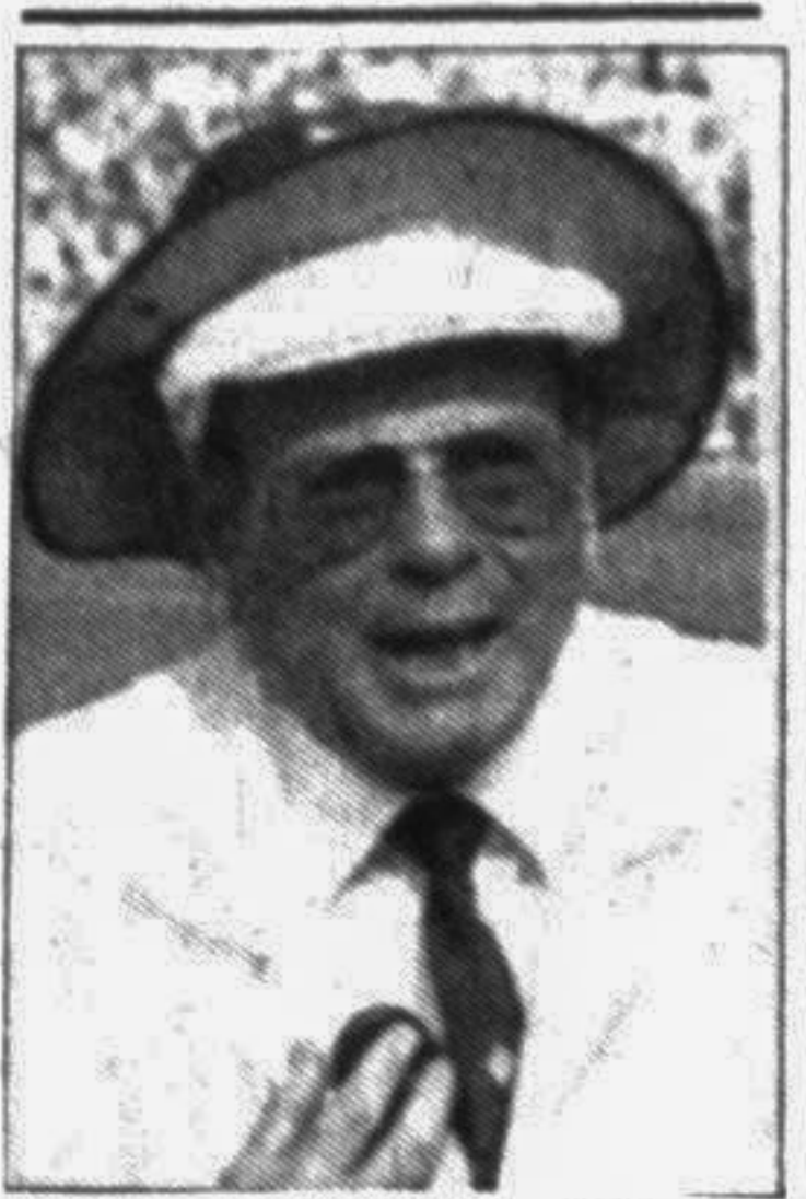
Harold Dickie Bird (World's most respected umpire) 'I'm feeling a little bit sad, it's the last time you can't stop age.' Expressing his sentiments to BBC on the eve of his farewell.