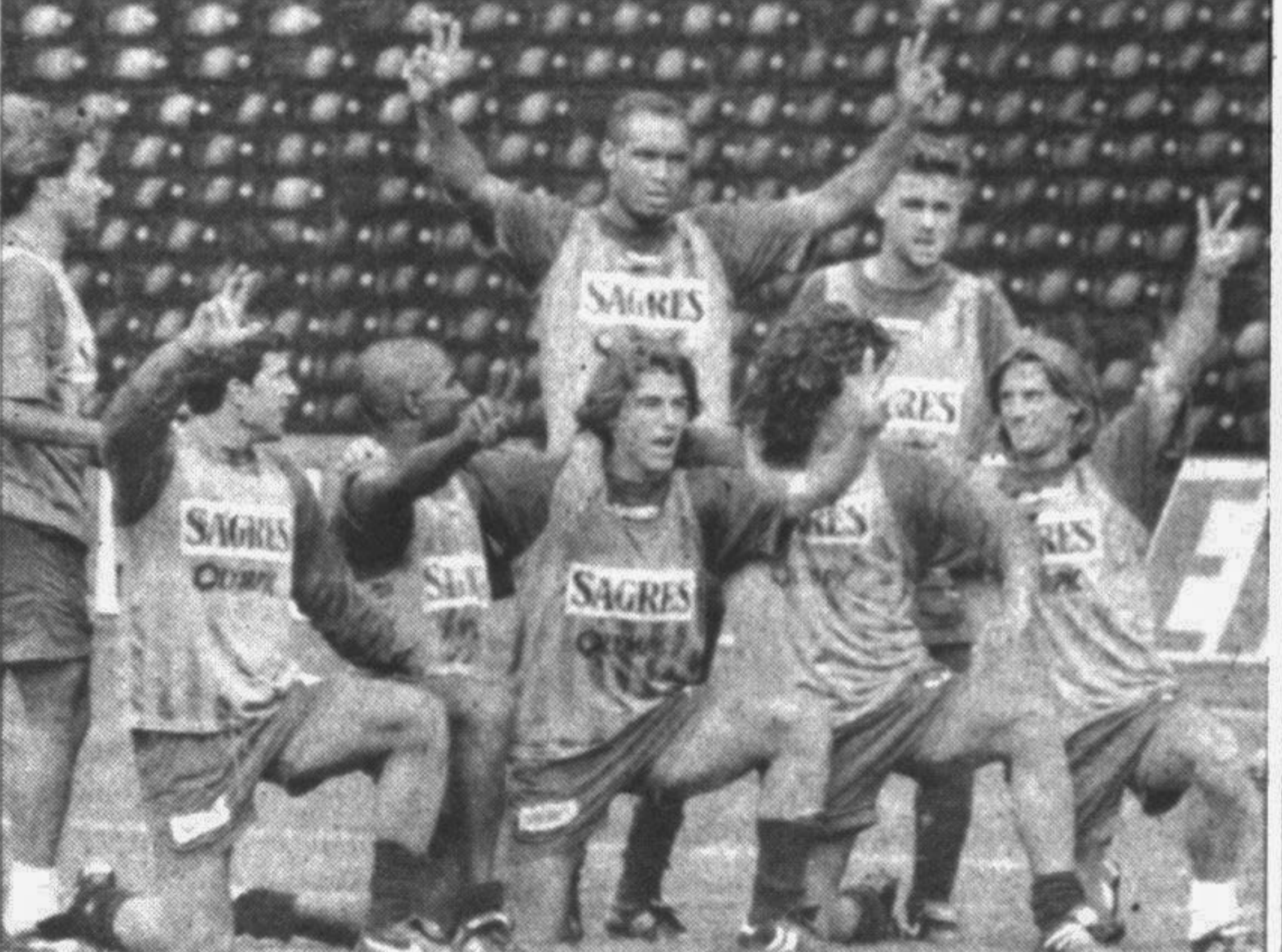
PASSION-PACKED: The exciting and adventurous Portuguese Euro '96 team members who have caught the imagination of soccer fans worldwide, look confident during practice at Birmingham on June 20. Portugal take on the Czech Republic in a quarterfinal fixture tomorrow.