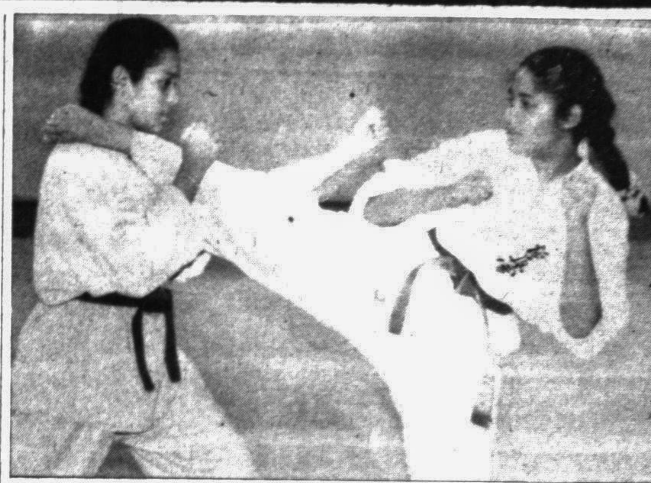
The first-ever black belt test in the country of the International Karate Organisation (IKO) was held at the Mirpur Indoor Stadium yesterday.