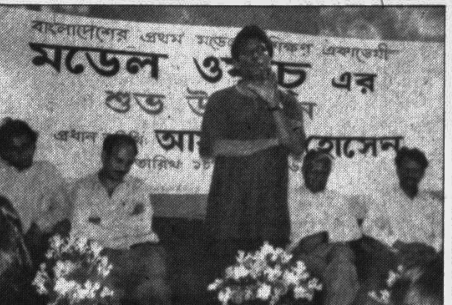
Artist Afzal Hossain speaking at the inaugural ceremony of Model Watch, the first ever training academy on modelling, in the city on Tuesday.

The annual budget for the fiscal 1996-97 will be presented in the session for the approval of the Senate following a discussion on the VC's speech.