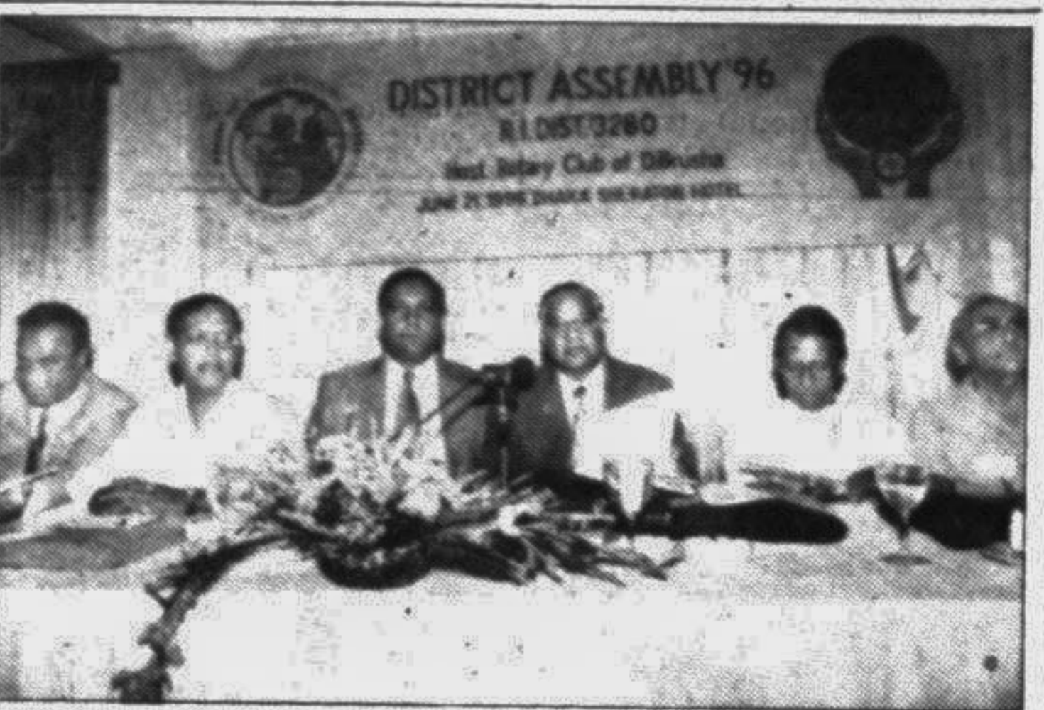
The district assembly '96 hosted by Rotary Club of Dilkusha, was held at Sheraton Hotel yesterday.

Documentary film show: Inaugural screening of two documentary films of Zakir Hossain Raju will be held. Venue: The German Cultural Centre auditorium. Time: 5.30 pm. 'Beyond The Borders', a film on the lives of intercultural couples of Bangladesh and Japan, and 'Images Under The Shadows', a reflection of women in media, will be screened. Both films were produced under the banner of Protishabda Alternative Communication Centre.