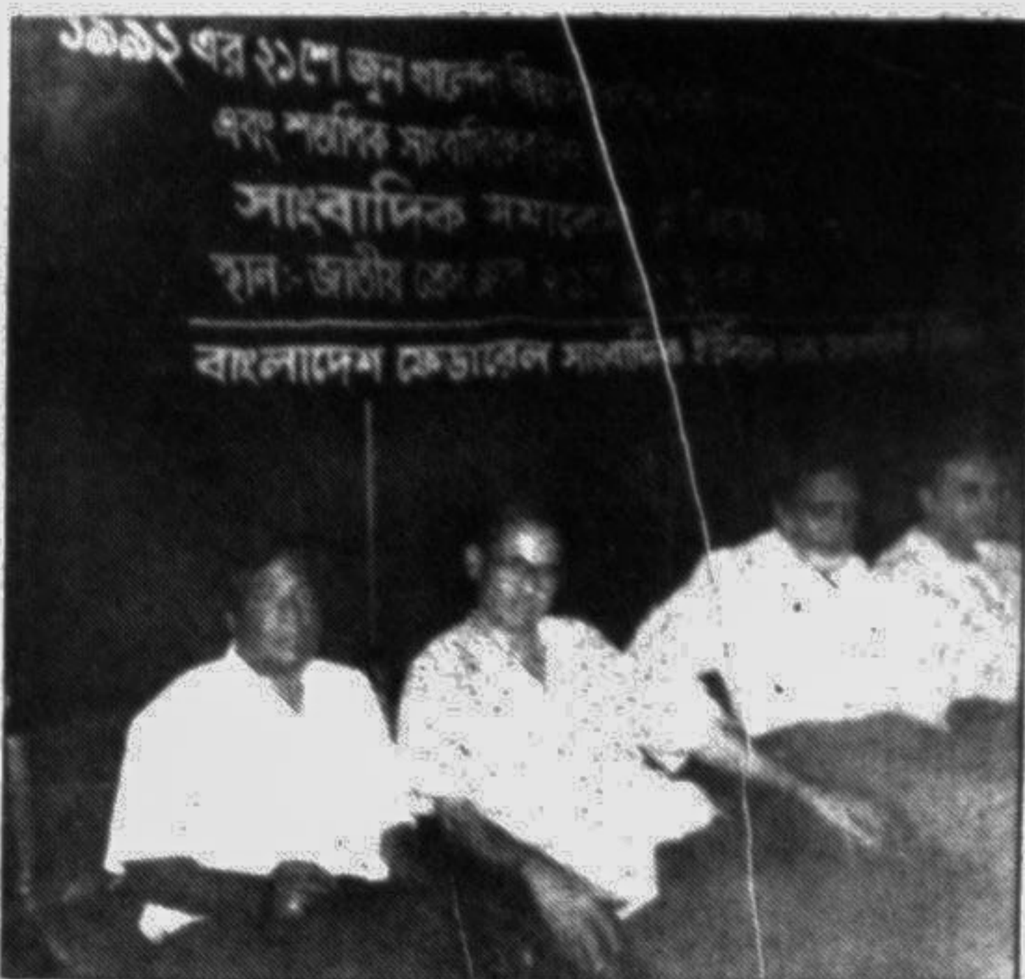
BFUJ and DUJ leaders at a rally organised in observance of the Journalist Repression Day yesterday.

The federating units of BFUJ in Chittagong, Khulna, Jessore, Dinajpur, Bogra, Mymensingh and Rajshahi also observed the day.