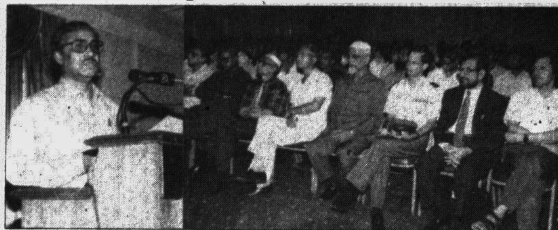
Defence Secretary M A Hakim addressing the inaugural ceremony of the SAARC seminar on 'Predictability of Monsoonal Rain and Flooding' in the city Wednesday.