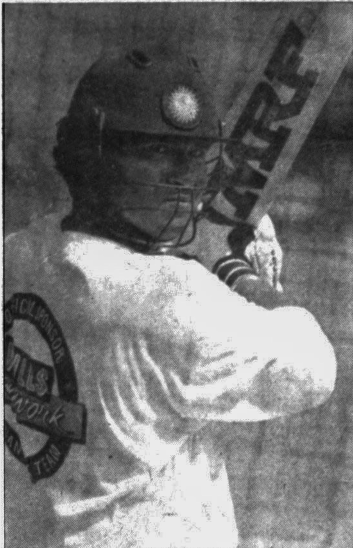
India's key weapon Sachin Tendulkar batting in the nets at Lord's on June 18. Tendulkar leads the Indian challenge against England in the second Test match starting today.

For one man it will be a last chance to taste the glory of international cricket, umpire Dickie Bird, standing in his 66th Test, retires after 23