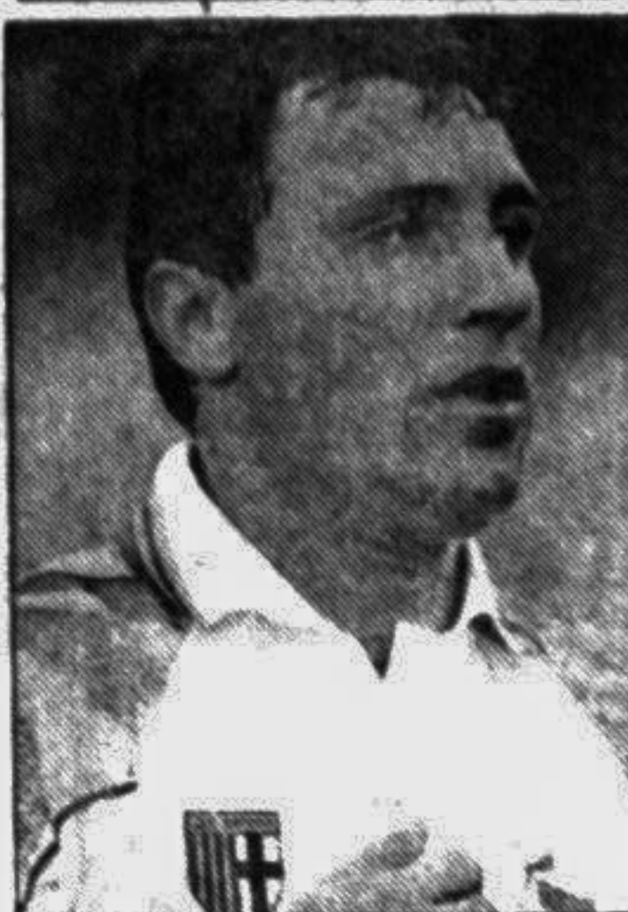
Hristo Stoichkov (Bulgaria's mercurial marksman) "I am genial, but mad too. No one knows what to expect from me — not even me." On his explosive temperament.

T HAT Victor Onopko, Russia's 1992 and 1993 Footballer of the Year, left Russia after thieves stole his Mitsubishi Pajero from under the windows of his Moscow apartment. Onopko was furious and hurt, and decided to go where a man can feel secure for his family and his property. The Moscow Spartak captain thought he had enough.