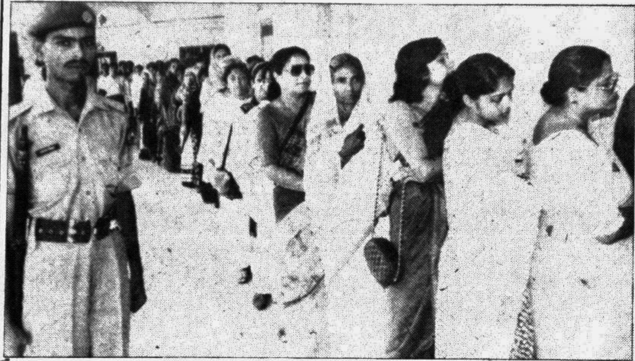
Women prove their awareness.