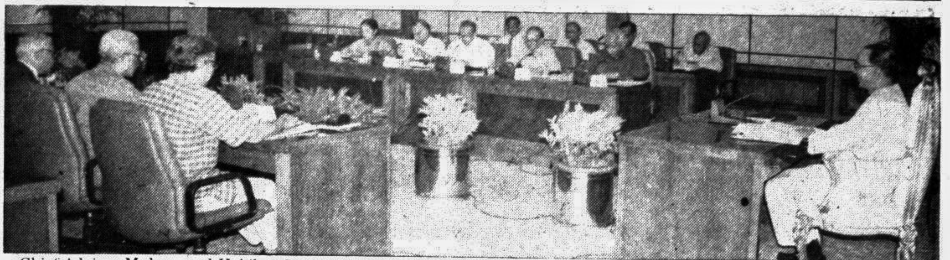
Chief Adviser Muhammad Habibur Rahman presiding over the meeting of the council of advisers at his office yesterday.

Classes of the MSS (final year) students (new batch) for the academic session 1992-93 will begin from May 18 next, the press release added.