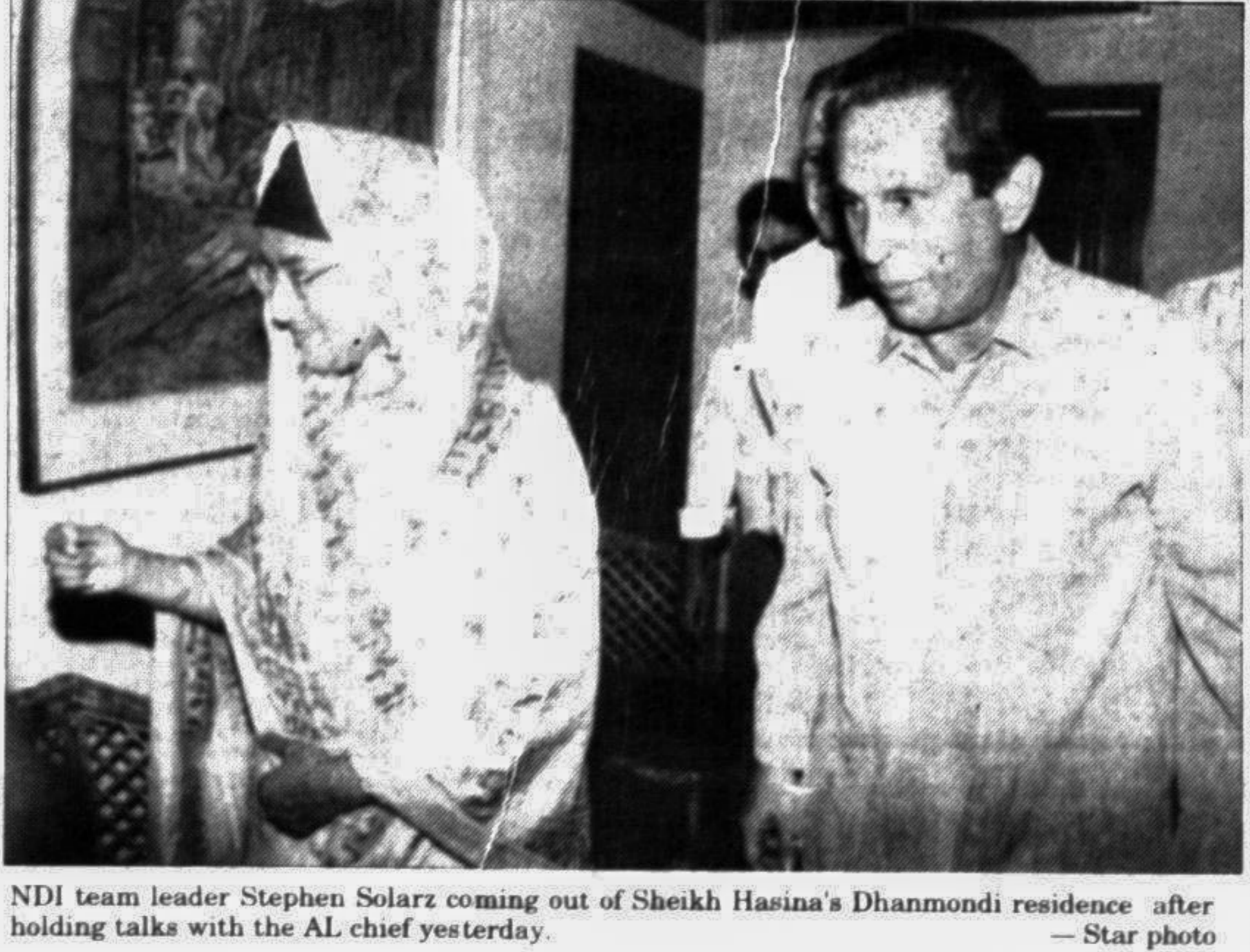
NDI team leader Stephen Solarz coming out of Sheikh Hasina's Dhanmondi residence after holding talks with the AL chief yesterday.

By Staff Correspondent BNP chairperson Begum Khaleda Zia yesterday expressed her apprehension that today's repolling at 122 polling centres under 27 constituencies would be marked by large-scale rigging and violence. In a press statement, Begum Zia said they had the information that the Awami League had organised 'terrorists' from across the country to snatch ballot papers and cast false votes at those 122 centres. "I am afraid that a blueprint to rig tomorrow's (Wednesday) repolling will be implemented through large-scale violence to snatch our victory as it was done during the June 12 elections," the former prime minister said in her statement issued last night. The painful incident involving BNP candidate K M Obaidur Rahman at Nagarkanda in Faridpur district and sabotaging of the election rally of Prof Badruddoza Chowdhury by means of heavy bombardments corroborate her apprehension, she said. Begum Zia said the BNP is leading in 13 out of the total 27 seats and if repolling is conducted in a free and fair way, there should be no iota of doubt in anybody's mind about the bright prospect of BNP's victory in all the 27 seats. Referring to terrorism and massive vote rigging in June 12 polls, she said her party produced documentary evidences before the EC to show how vote rigging was conducted in a systematic and planned way in 111 constituencies. See Page 12 col 7