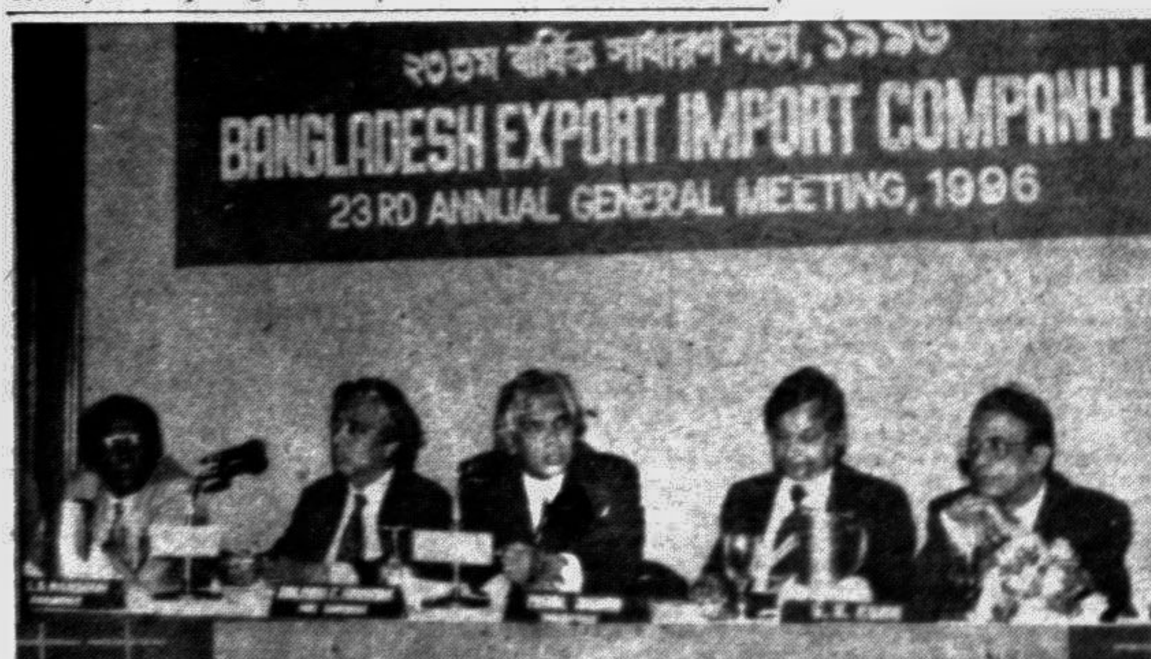
The 23rd annual general meeting of Bangladesh Export Import Company Ltd was held at Sonargaon Hotel in the city yesterday.

The FEMA is a non-partisan coalition of 170 national and local non-governmental organisations that fielded over 25,000 observers in almost all polling centres across the country on the polling day.