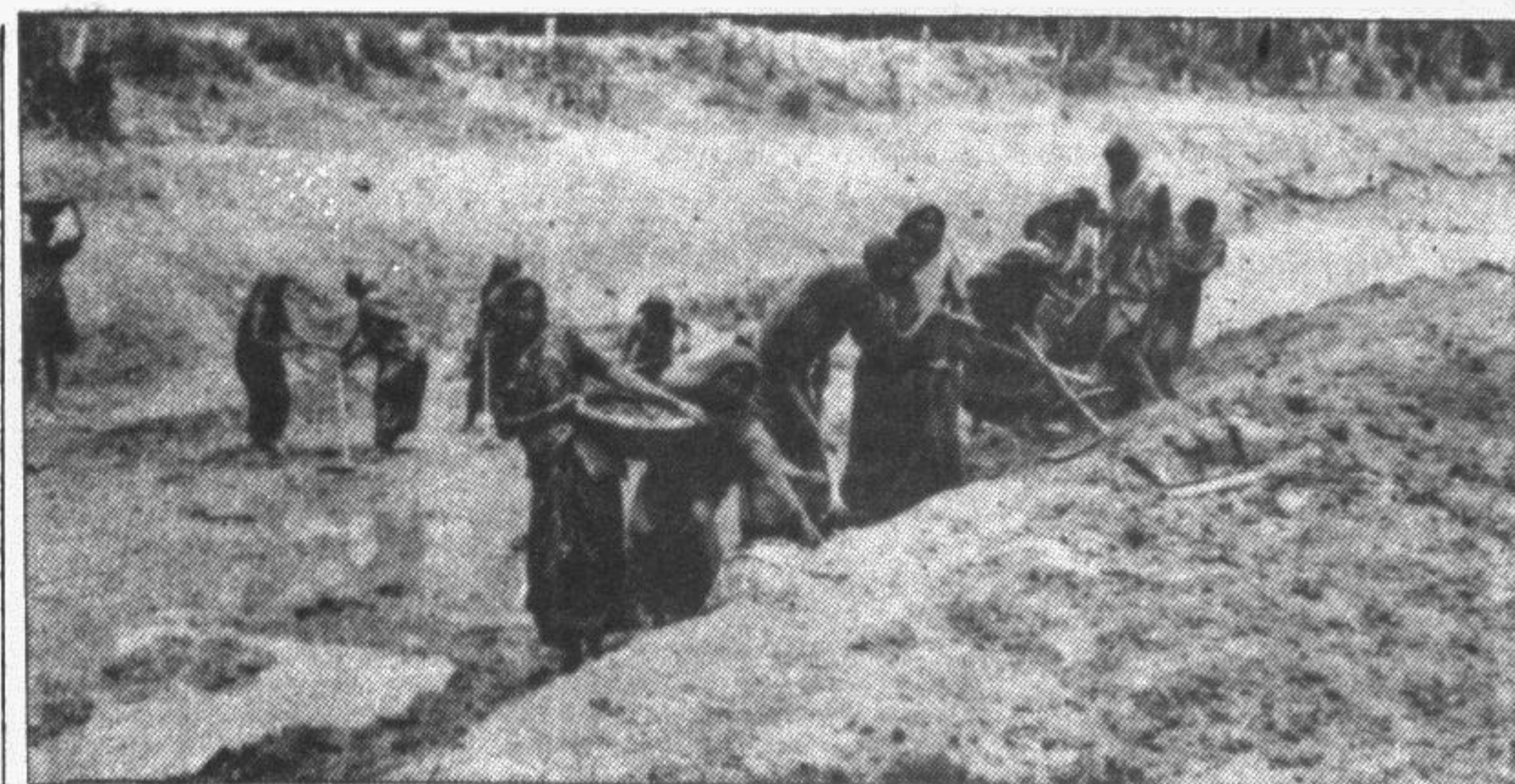
WOMEN AT WORK: Landless women are employed in earthworks at a project in Tangail.

They also assured all possible assistance from the government side to improve the condition of the distressed women of the society.