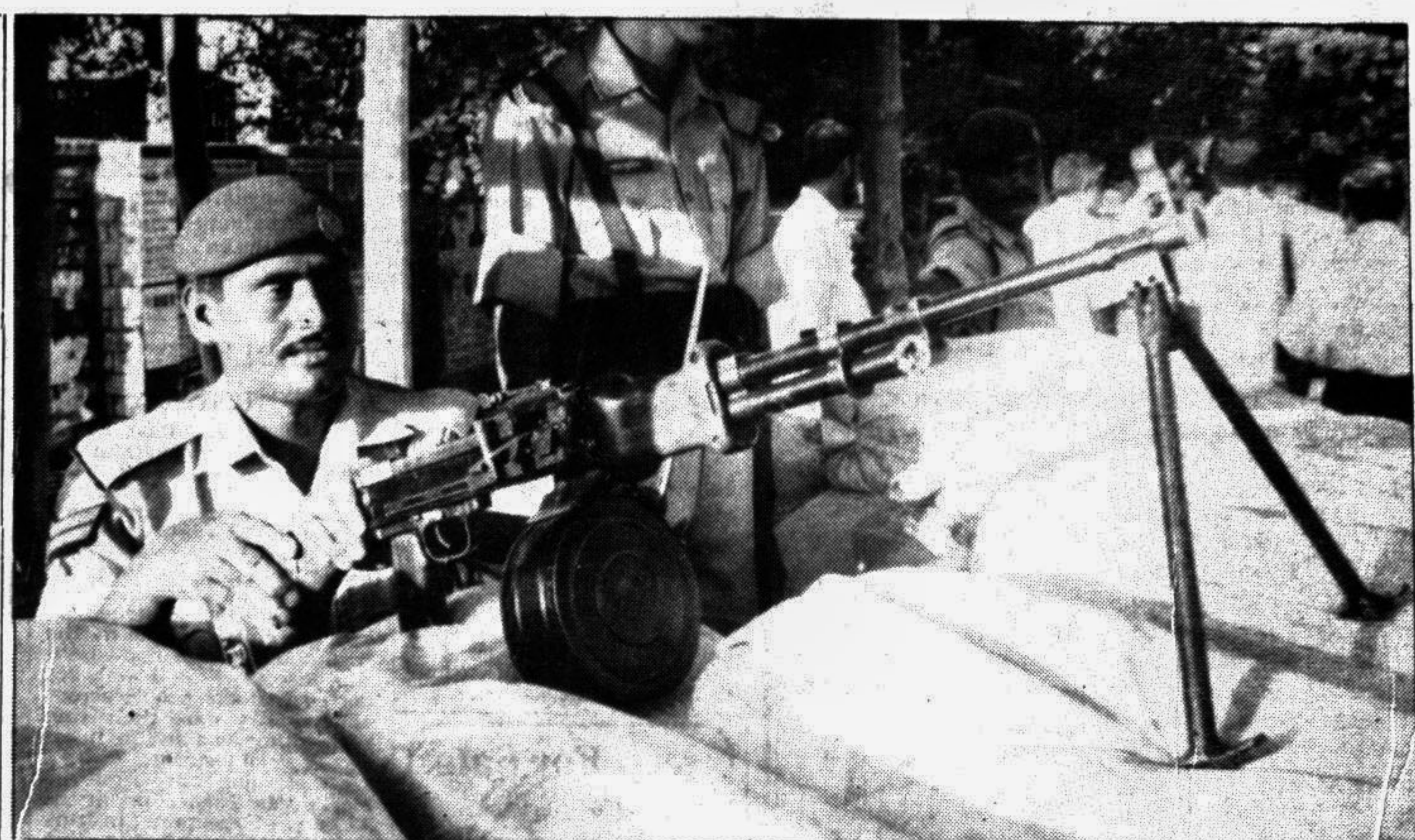
Members of the armed police battalion guarding the Dhanmondi residence of AL chief Sheikh Hasina.

Earlier, the Commission announced the unofficial results of the parliamentary seats.