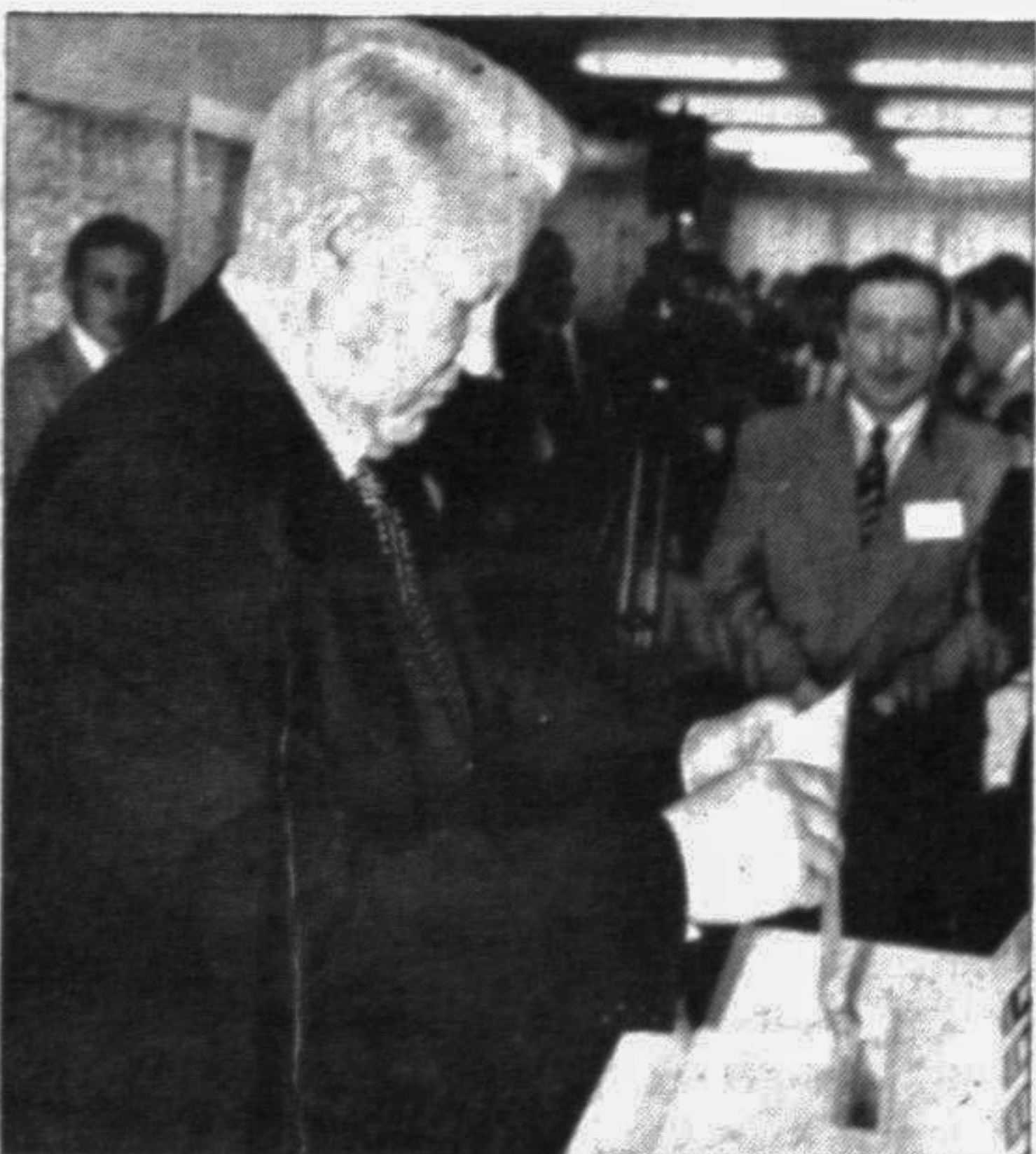
Russian President Boris Yeltsin casting his vote in Moscow's Krylatskoye district yesterday in Russia's first post-Communist presidential elections.

MOSCOW, June 16: As the world watched anxiously, Russians voted today in a momentous presidential election that could deal a fatal blow to Boris Yeltsin's reforms and return the country to Soviet-style communism, report AP, Reuters.