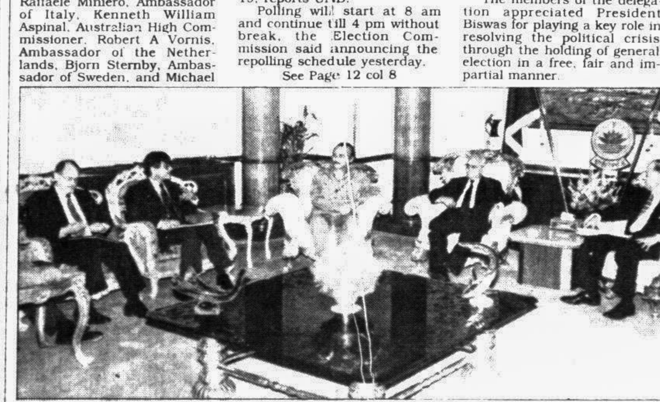
A delegation of the ambassadors of Western countries led by US Ambassador in Bangladesh David N Merrill called on President Abdur Rahman Biswas at Bangabhaban yesterday.

Repolling in 122 centres of 27 constituencies in 13 districts where voting on June 12 were marred by untoward incidents will be held on June 19, reports UNB. Polling will start at 8 am and continue till 4 pm without break. The Election Commission said announcing the repolling schedule yesterday. See Page 12 col 8