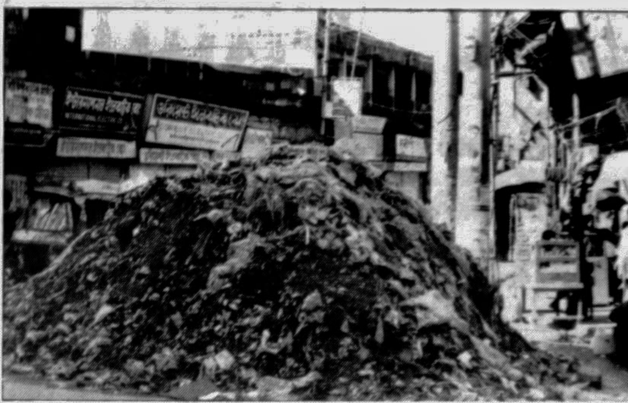
A heap of garbage dumped on a roadside at Patuatuli in the older part of the city.

Quilkhani of the deceased will be held after Asr prayers also tomorrow at 7, Circuit House Road, Rahma, Dhaka.