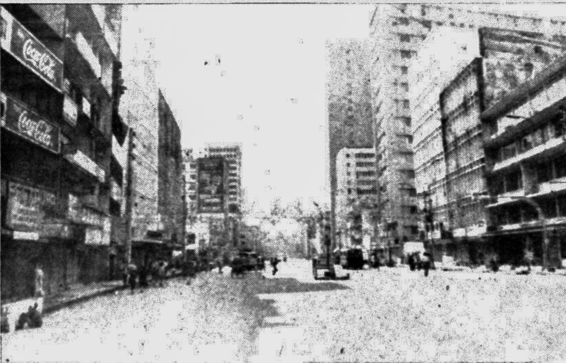
Despite a working day yesterday, city's Motijheel Commercial Area wore a deserted look as the city dwellers were glued in front of their TV and radio in anticipation of the polls results.

BCL memo to CEC By Staff Correspondent A group of pro-Awami Chhara League activists from different residential halls of the Dhaka University submitted a memorandum to the Chief Election Commissioner (CEC), urging fair repolling at the 28 constituencies where polling was postponed. The BCL activists in a truck went to the Election Commission at Sher-e-Bangla Nagar in the city around 9 pm yesterday. But they were intercepted by police at the gate of the EC office. The BCL workers handed over the memorandum to the police to deliver it to the CEC, according to an activist from the Mohsin Hall of DU. Play due role in strengthening democracy: Kamal A meeting of the standing committee of Gono Forum yesterday called upon all concerned to play their due role in consolidating parliamentary democracy in the country, reports UNB. In a resolution, the meeting said the spontaneous participation of the people in Wednesday's parliamentary election reflected their hopes and aspiration for the democratic process to march ahead. The meeting, presided over by party president Dr Kamal Hossain, congratulated the countrymen for massively participating in the polls, and the caretaker government and EC