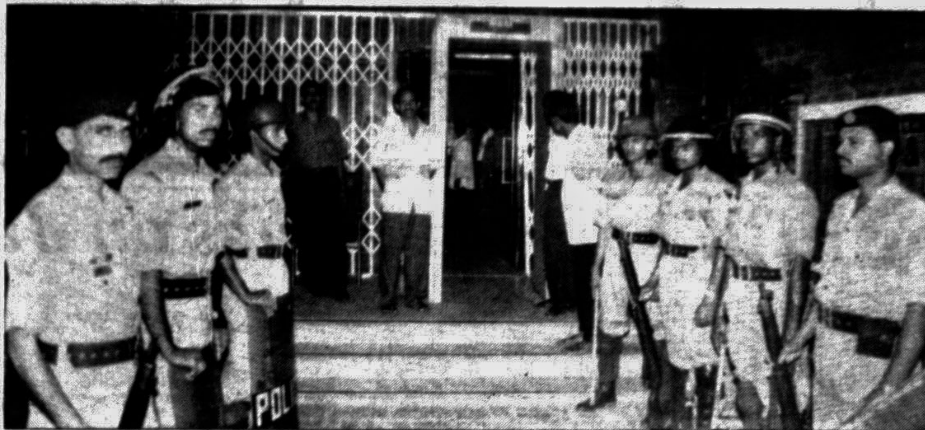
Members of the security forces guarding Election Commission office in the city yesterday.