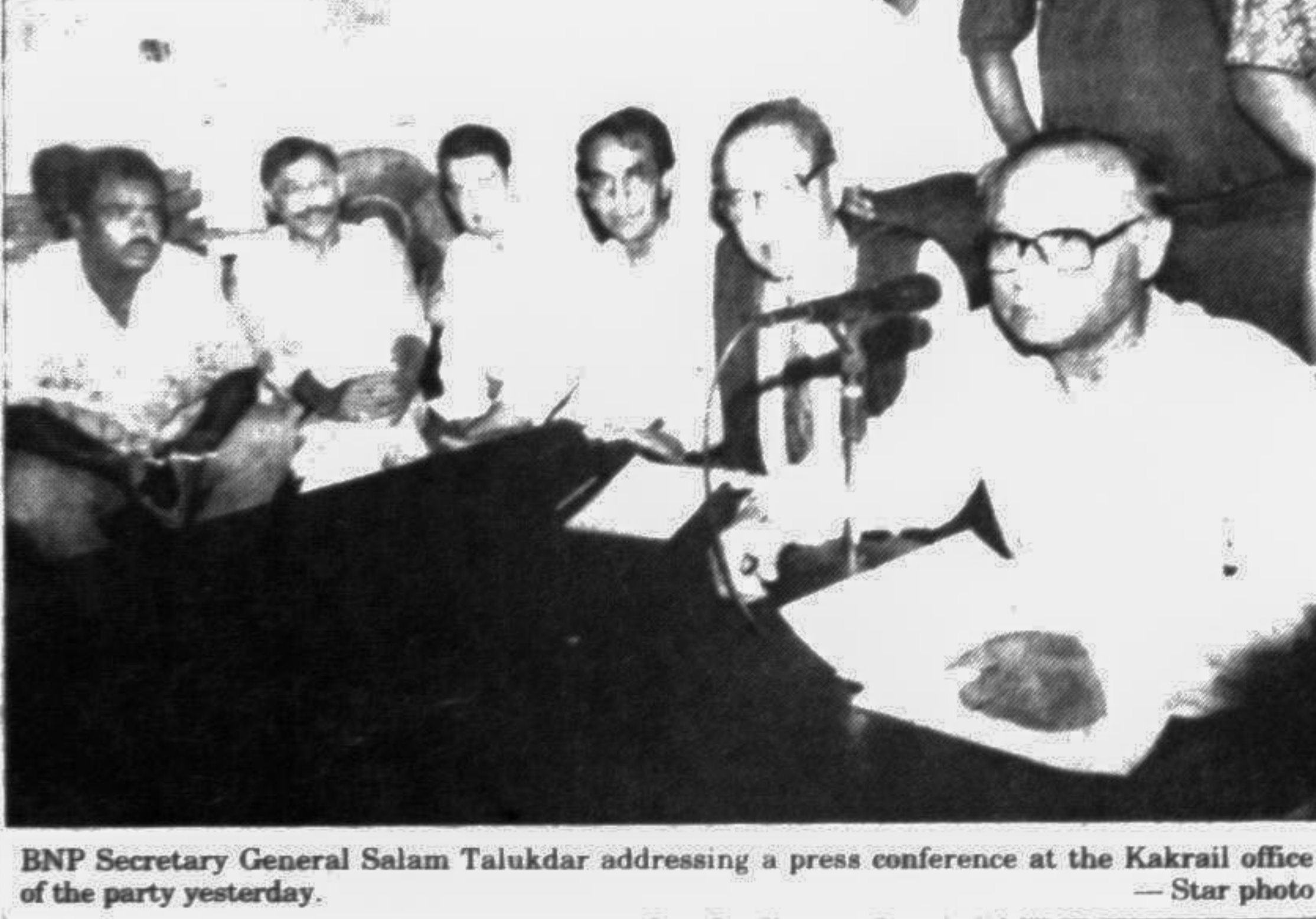
BNP Secretary General Salam Talukdar addressing a press conference at the Kakrail office of the party yesterday.