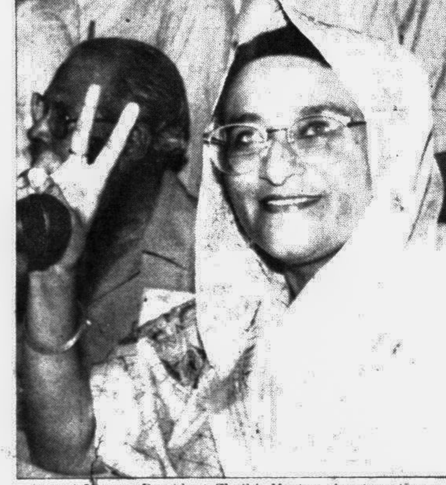
Awami League President Sheikh Hasina showing victory sign at the press conference yesterday.

By Staff Correspondent Awami League chief Sheikh Hasina has said her party is ready to form the next government and is now waiting for an invitation from the President. "I hope we are going to gain absolute majority and are now fully prepared to form the next government," she said. The AL president was making a statement and answering newsmen's questions at a press conference, first after Wednesday's parliamentary polls, held last night at her Dhanmondi residence in the city.