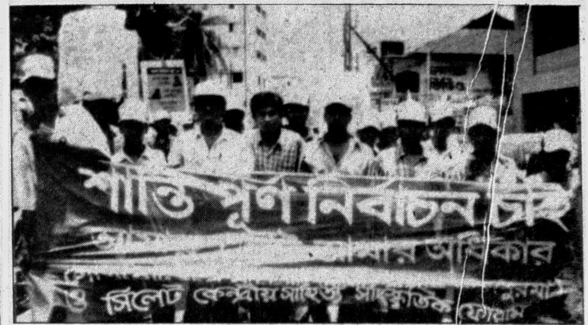
SYLHET: The district Kendriya Sahitya Sangskritik Forum and Society for Unity of the Rural Mass (SURMA) jointly brought out a rally on last Saturday demanding a peaceful election.

A total of 47 candidates are contesting in the seven constituencies. A total of 15,04,823 voters are expected to cast their votes.