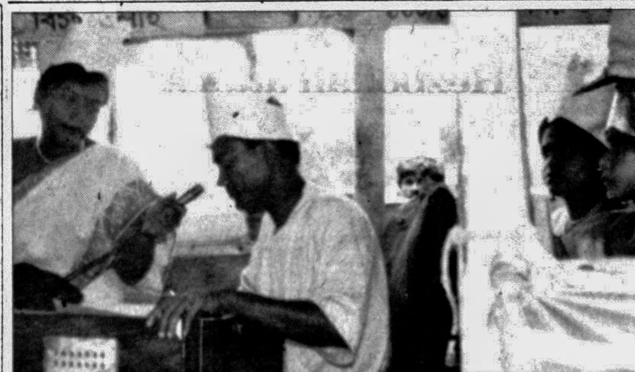
NARAYANGANJ: The district spots has organised a mobile publicity programme in a different form (rendering various songs) at various points of the town to motivate people to participate in the June 12 election.

Power supply to Patharghata thana remained suspended due to fault in gridline connecting from Bhandaria of Pirojpur district which is yet to be restored, PDB sources said.