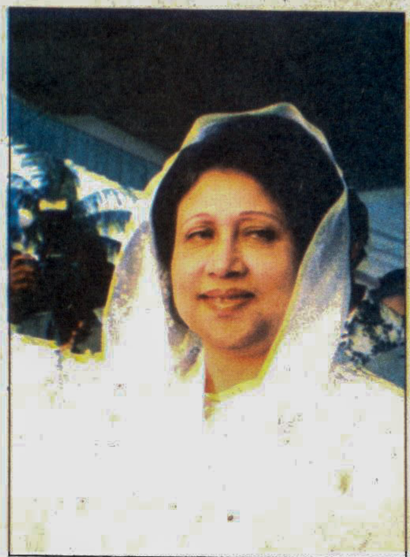
BNP chairperson Begum Khaleda Zia