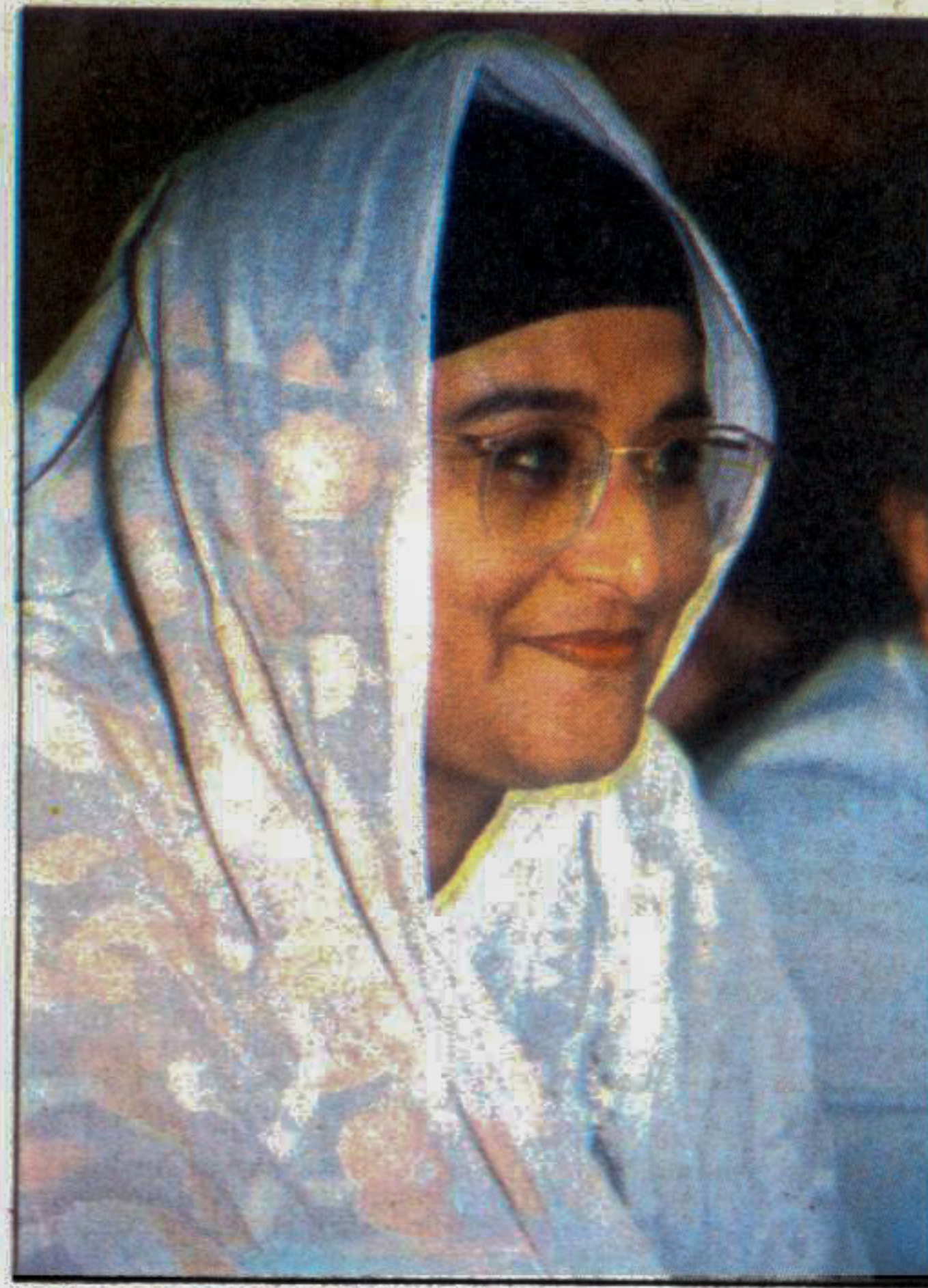
AL president Sheikh Hasina