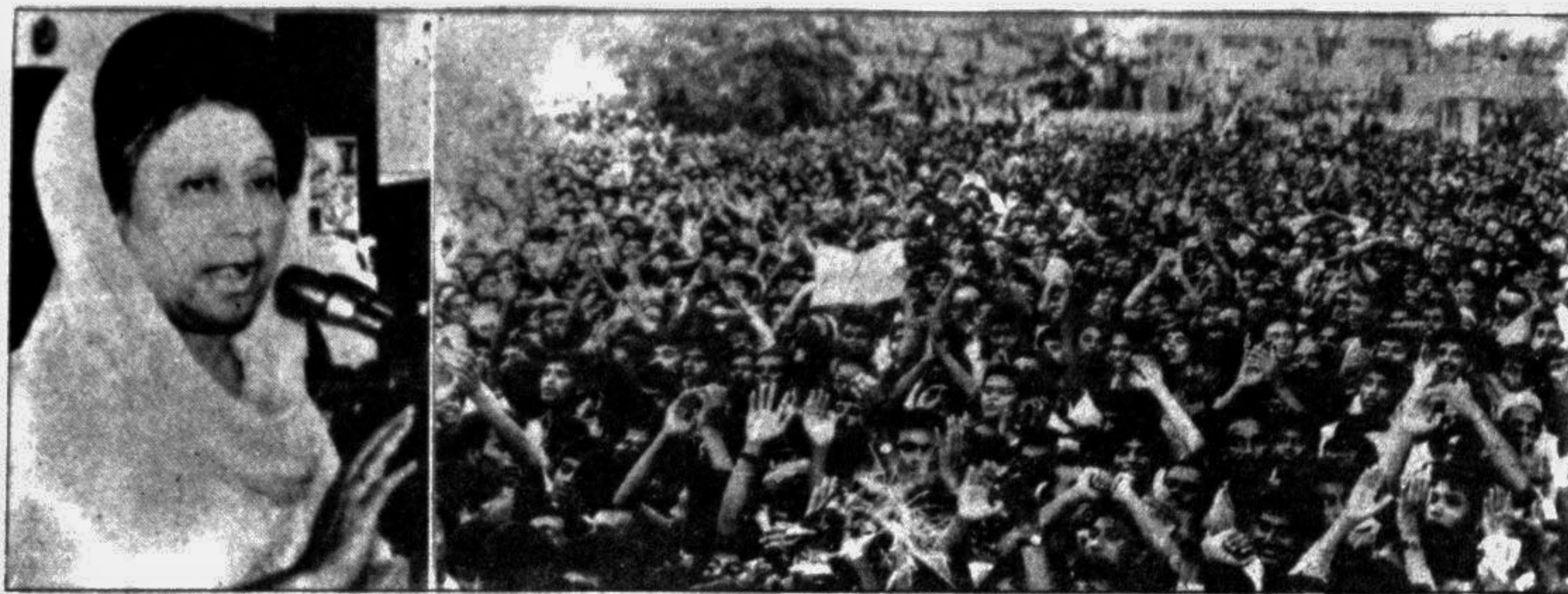
BNP Chairperson Begum Khaleda Zia addressing a public gathering as part of election campaign at the Registry Maidan of Sylhet town on Monday last.