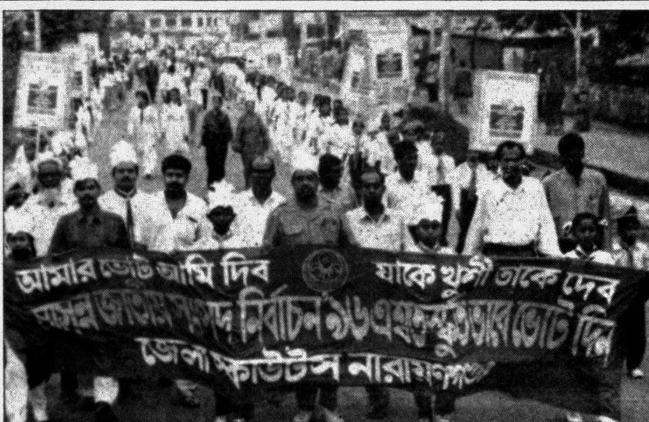
NARAYANGANJ: To encourage the voters to cast their votes and to make them aware about their voting rights, a rally was brought out by the district scouts here last Thursday.