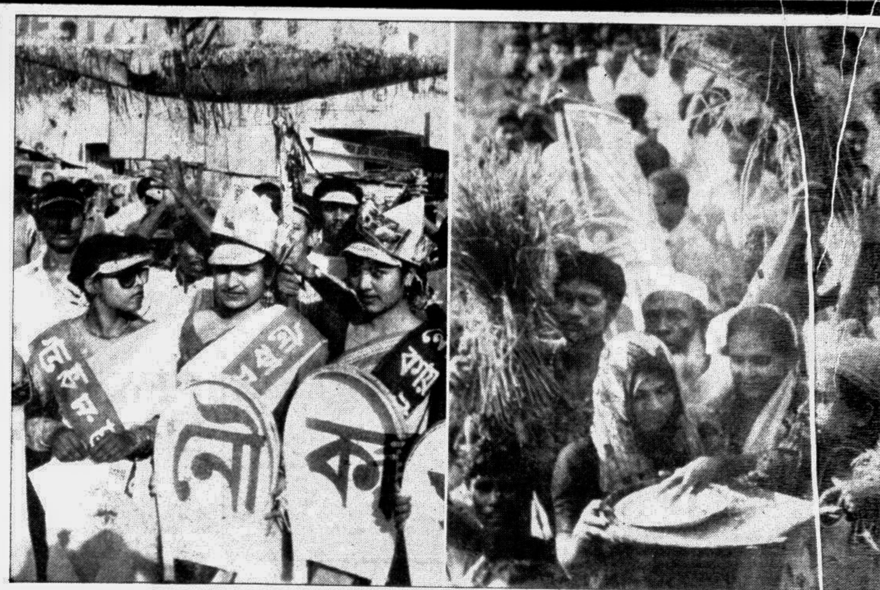
Last-minute campaign by Awami League (L) and BNP (R) in the city yesterday.