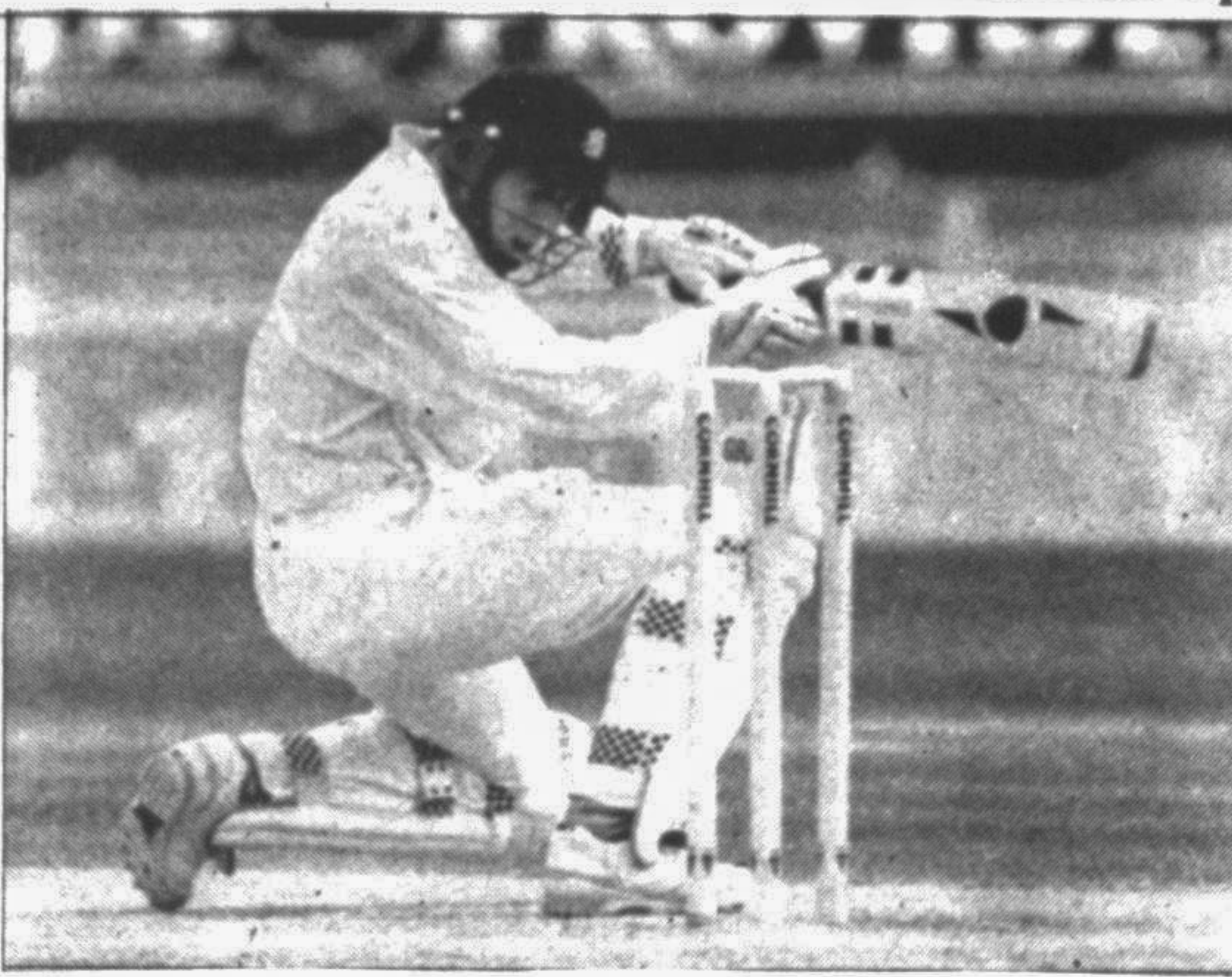
Mike Atherton the England skipper seem to have all the time and room in the world as he executes an improvised square cut during the second innings of the first Test against India at Edgbaston yesterday.

RIO DE JANEIRO, June 9: Palmeiras won the Sao Paulo championship on Sunday by beating Santos 2-0 in a game which saw Santos goalkeeper Edinho, the son of Pele, sent off, reports Reuter.