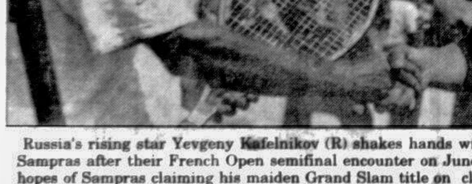
Russia's rising star Yevgeny Kafelnikov (R) shakes hands with American world No 1 Pete Sampras after their French Open semifinal encounter on June 7. Kafelnikov put pay to any hopes of Sampras claiming his maiden Grand Slam title on clay.