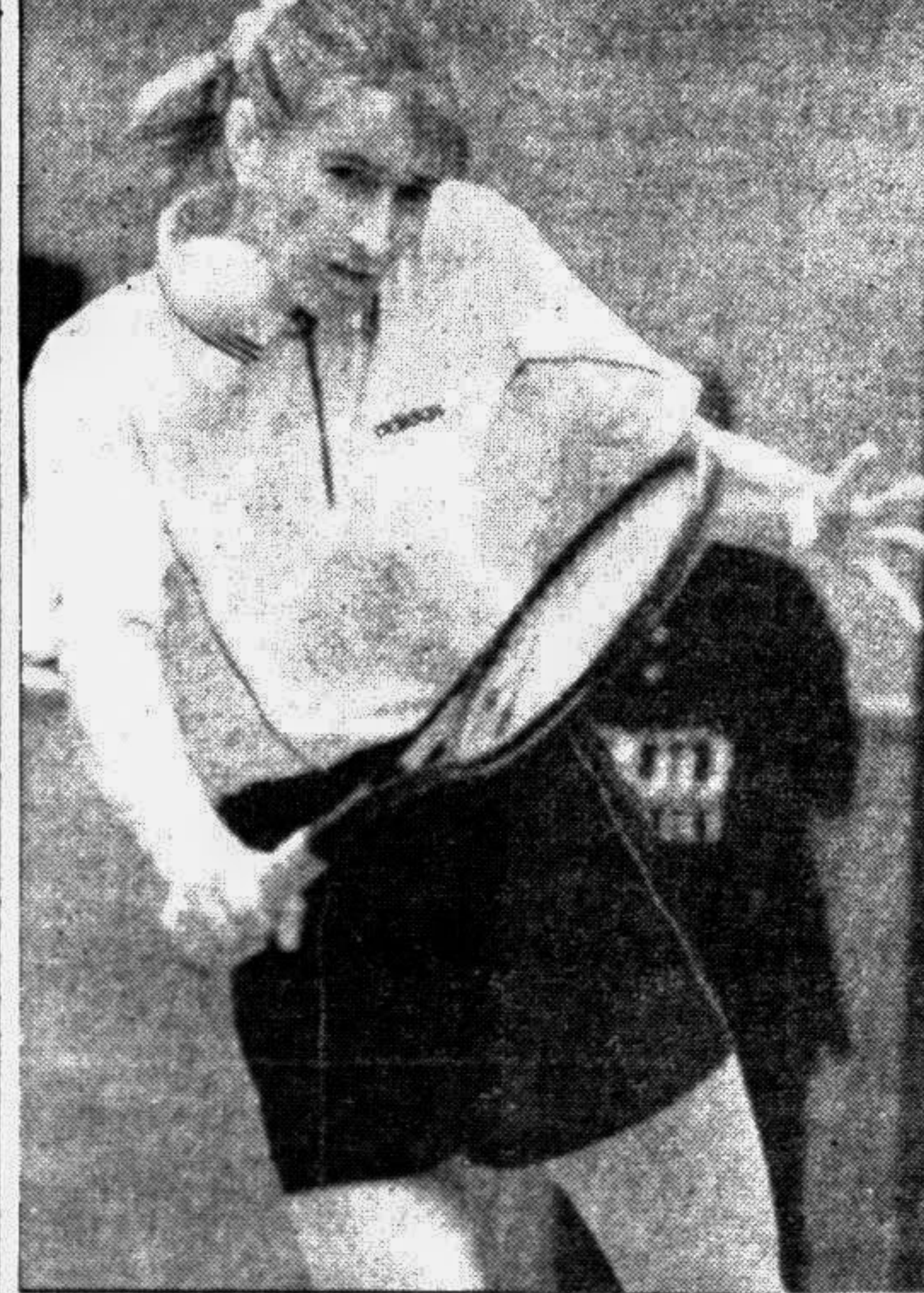
STEFFI GRAF ... the princess of German tennis clinched her 19th Grand Slam trophy yesterday.

She then had to climb back into the match when Sanchez-Vicario was serving for the title at 5-4 in the final set. It was Graf's 27th win over the fourth-seeded Spaniard in 35 meetings. Graf's 19 Grand Slam titles ties her for third on the all-time singles list with Chris Evert and Martina Navratilova. Helen Wills Moody has 19 and the women's singles leader is Margaret Smith Court with 24. The German won three Grand Slam titles last year, beating Sanchez-Vicario at the French Open and Wimbledon and taking the US Open over Seles, who lost in the quarter-finals. Sanchez-Vicario last year made it to three Grand Slam finals and reached No 1 early in 1995. But she lost in the Australian Open quarterfinals this year and has slipped to No 3. Sanchez-Vicario, twice a winner here, defeated Graf in the 1989 final but was beaten by the world number-one in last year's final. Graf's other French title wins came in 1987, 1988, 1993 and 1995. The showdown on the Roland Garros Centre Court, started under grey skies, survived a bout of drizzle, enjoyed sunshine and was finally threatened by new black clouds.