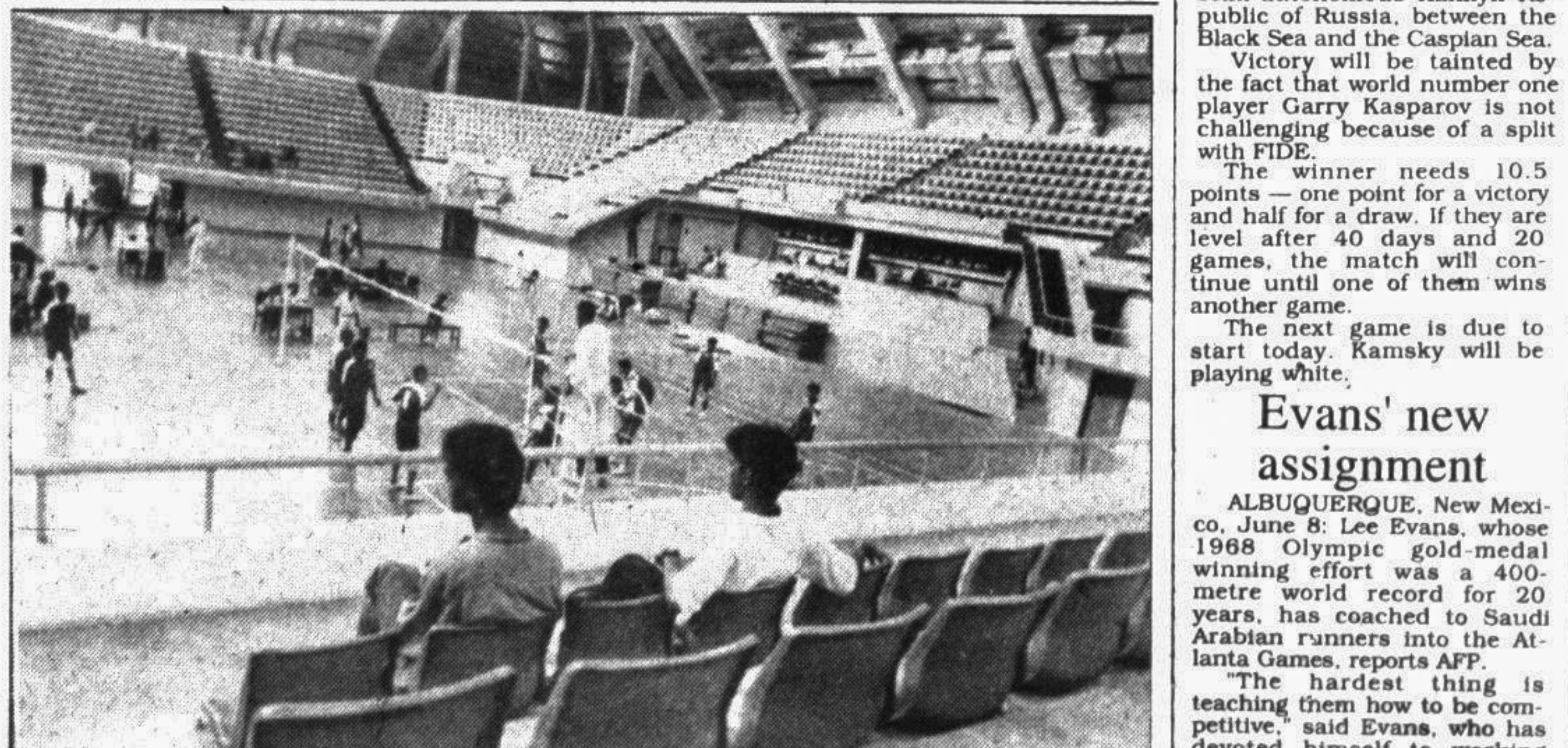
ALL THAT GLITTERS IS NOT GOLD: The pompous setting of the Mirpur National Indoor Stadium wears a barren look with hardly any spectators during the ongoing Senior Division volleyball league. One wonders whether organising such unpopular tournaments in an artificially lit air-conditioned space is at all justified, particularly when flood-lit courts at the Outer Stadium have been traditional crowd-pullers.