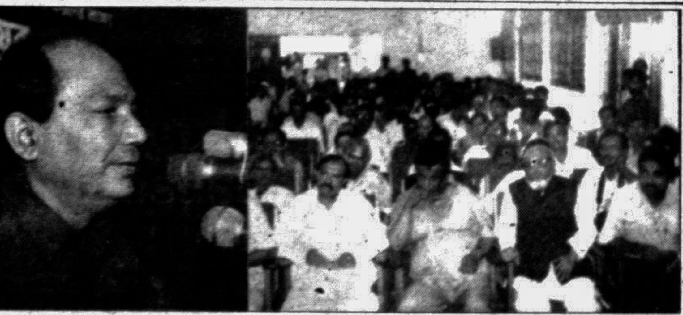
SYLHET: The Chief Election Commissioner Mohammad Abu Hena addressing a meeting with the political leaders, elite, candidates and government officials of four districts of Sylhet Division on Wednesday.

Another victim at Dapunia bazar in the Mymensingh-4 constituency left at least 20 people injured, four of them seriously.