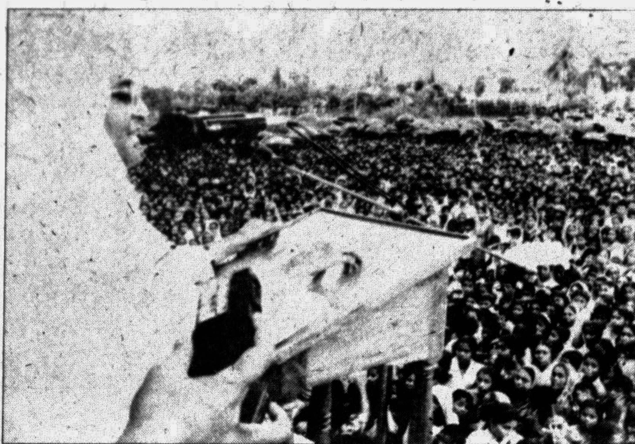
Awami League president Sheikh Hasina addressing a public meeting during her election campaign at Chalna Port in Khulna on Thursday.