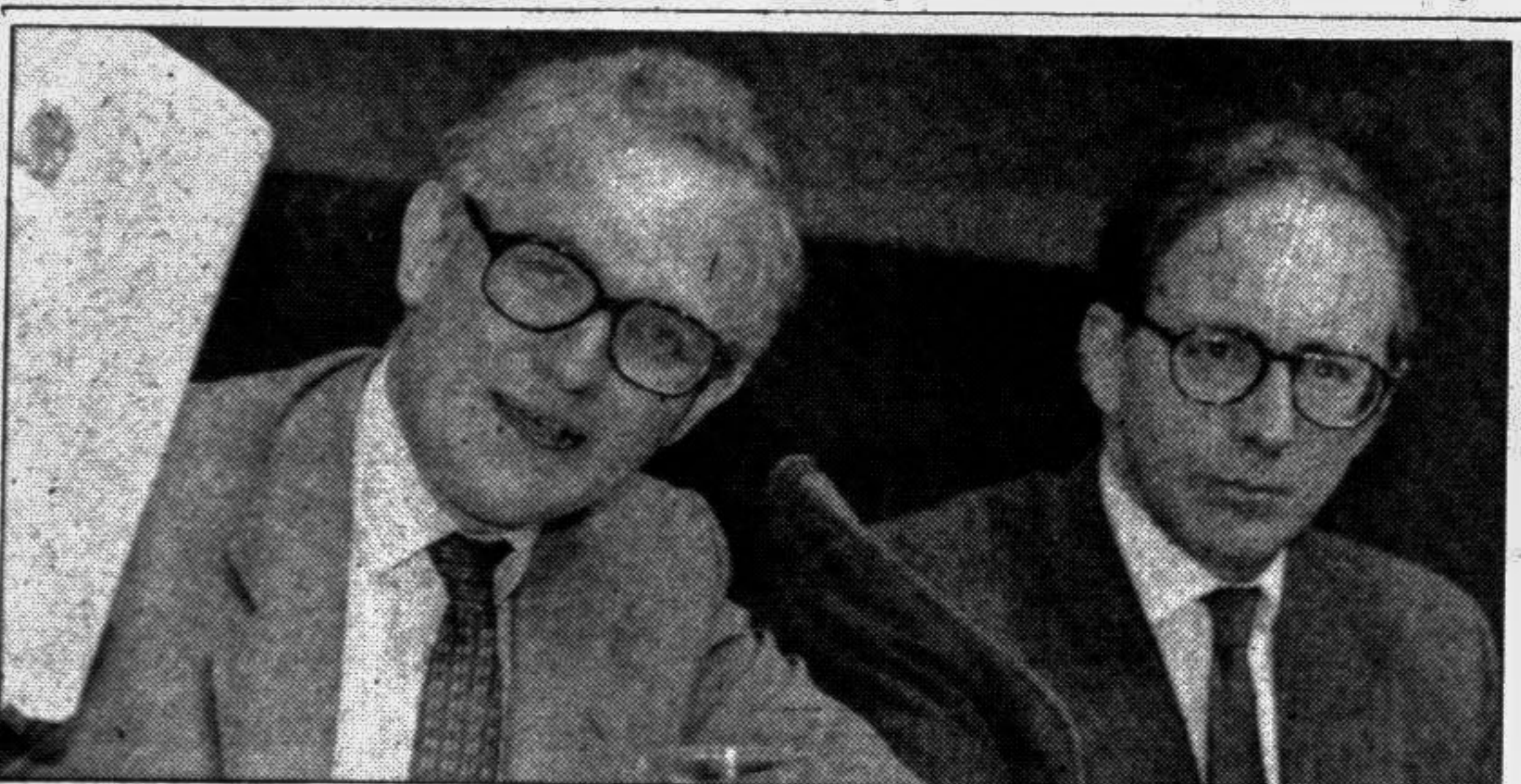
Great Britain's Agriculture Minister Douglas Hogg (L) shows some documents as British Foreign Minister Malcolm Rifkind looks on during a press conference in Brussels on Tuesday. Rifkind warned that Britain will not recoil from wrecking a summit of European Union leaders in its campaign to overturn the ban on its beef exports.

The United Front government will continue to work for universal nuclear disarmament and will retain the nuclear option till this goal is achieved," the alliance said.