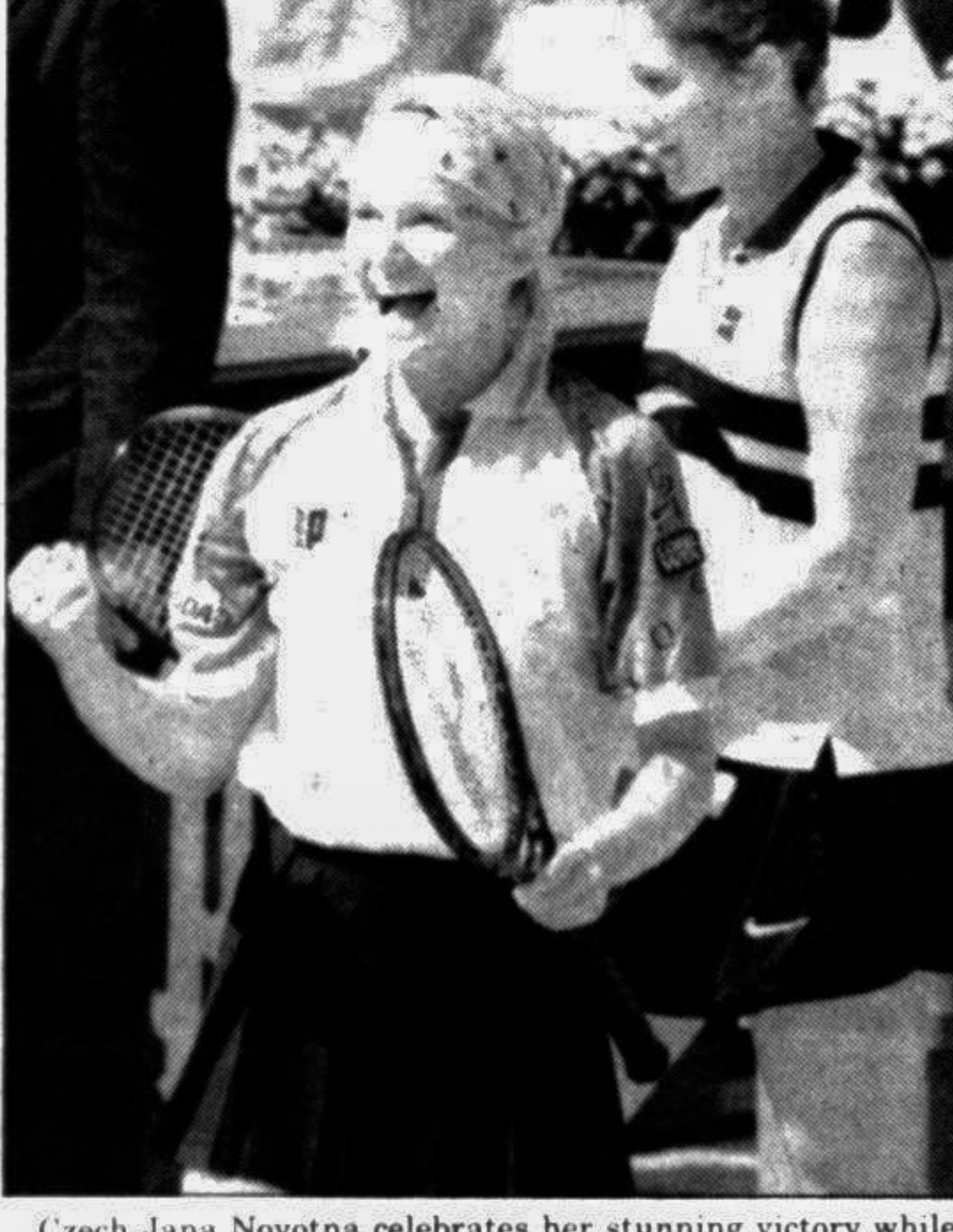
Czech Jana Novotna celebrates her stunning victory while world co-number one, Monica Seles walks away with dejection after their quarterfinal clash at the French Open on June 4. Experienced Novotna caused the major upset sending the Yugoslav-born American packing 6-7(7-9), 3-6.

Kafelnikov, who had not dropped a set in the earlier