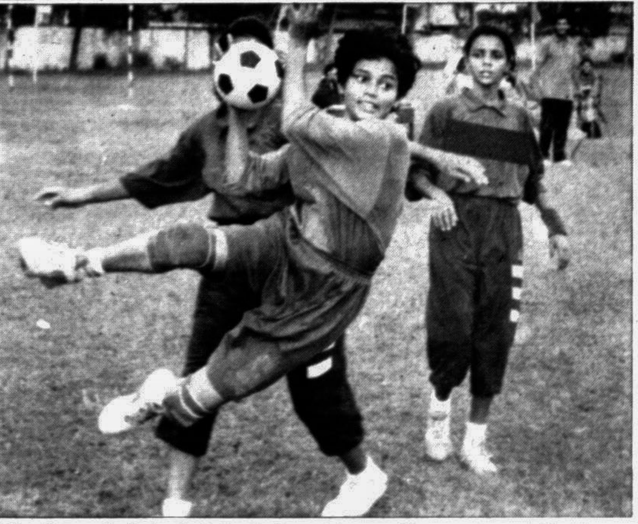
Action from yesterday's schools handball match between Viquarunnissa and Maghbazar High.

South Korea is sharing the World Cup matches with Japan.