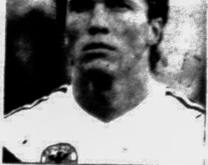
LOTHAR MATTHAEUS to Munich from Monaco.

Matthaeus, who has challenged his teammate to a live television debate to resolve the row, said Klinsmann had begged him during the 1994 World Cup to persuade Beckenbauer to take him back.