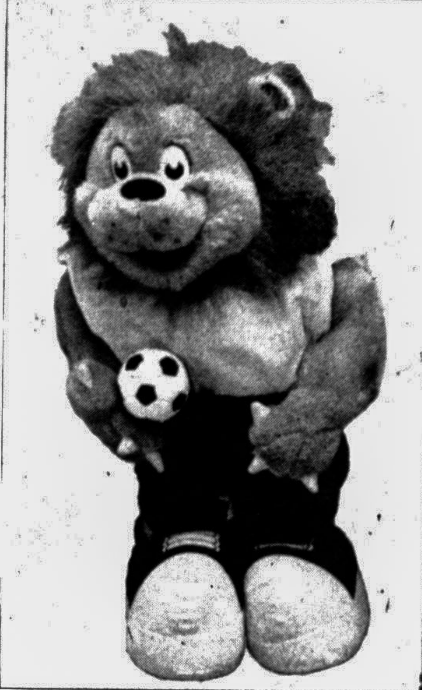
"Goliath" the lion, is the mascot for the forthcoming Euro '96 football championship, is on sale now in a large number of London shops.

come from behind as they beat Finland 2-1 in Helsinki. Ajax striker Jari Litmanen opened the scoring on 25 minutes but Tugay Kerimoglu equalised on 35 and Saffet Sancikli netted the winner ten minutes after the break.