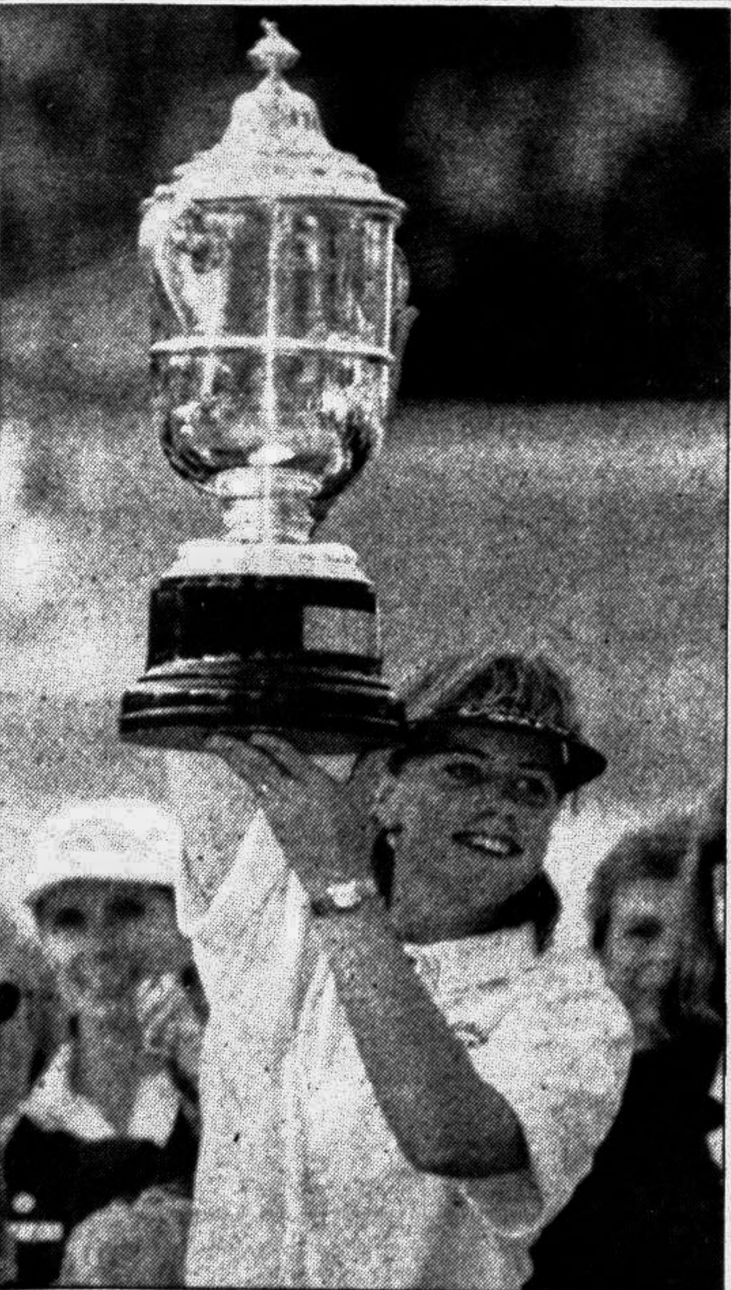
Annika Sorenstram of Sweden holds aloft the winner's trophy of the US Open golf championship at the Pine Needles Lodge and Golf Club in Southern Pines, NC, on June 2. She finished with an 8 under par score of 272 strokes.

Graeme Hick played a key role as Worcestershire beat Hampshire by 36 runs to maintain the current longest unbeaten run in the Sunday League.