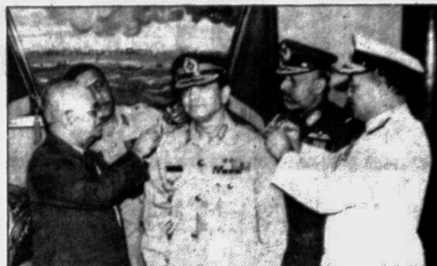
President Abdur Rahman Biswas ceremonially adorning Chief of Army Staff Maj General Muhammad Mahbubur Rahman with the badge of the rank of Lieutenant General at Bangabhaban yesterday.