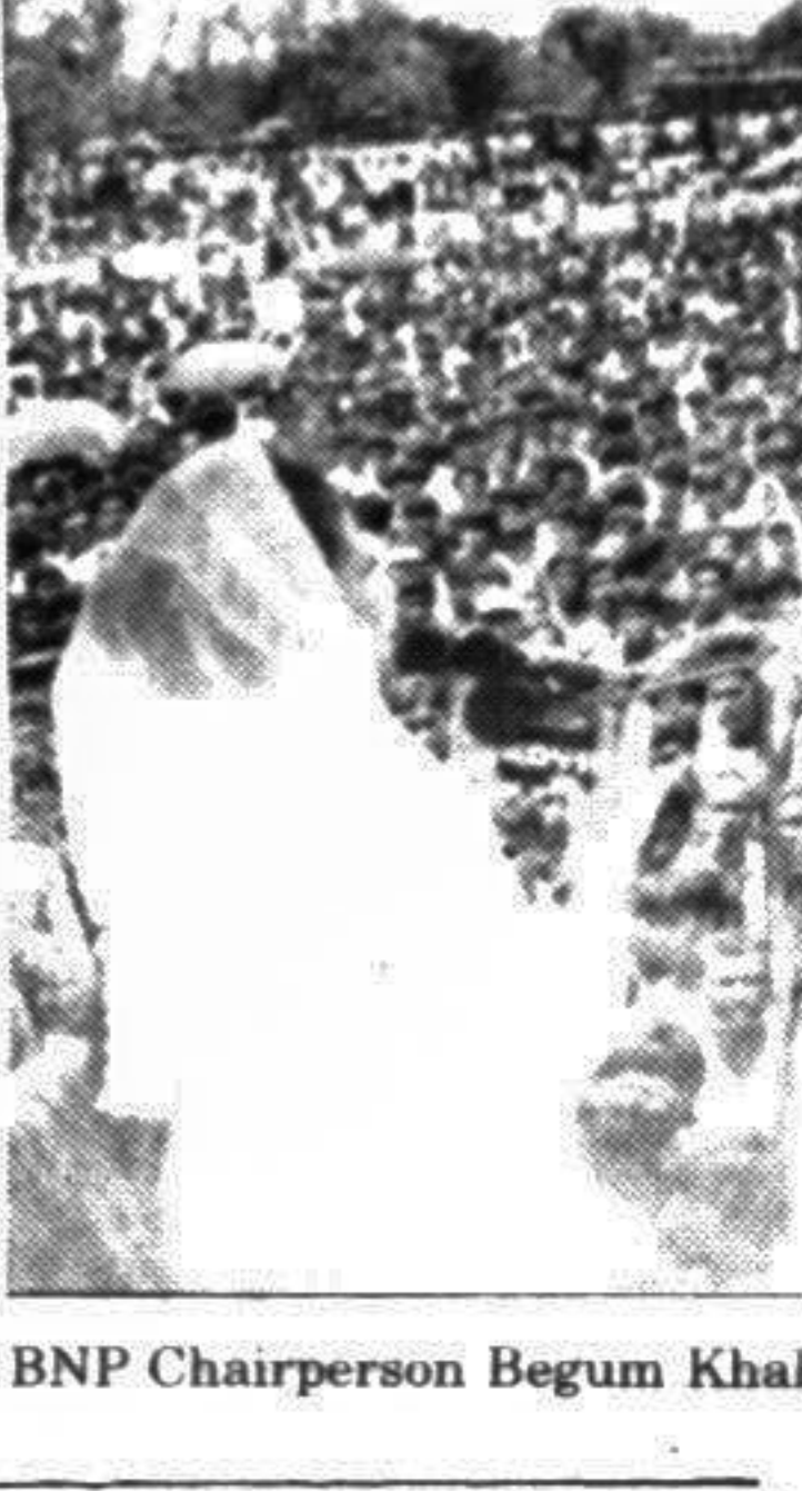
BNP Chairperson Begum Khaleda Zia addressing an election meeting at Savar yesterday.