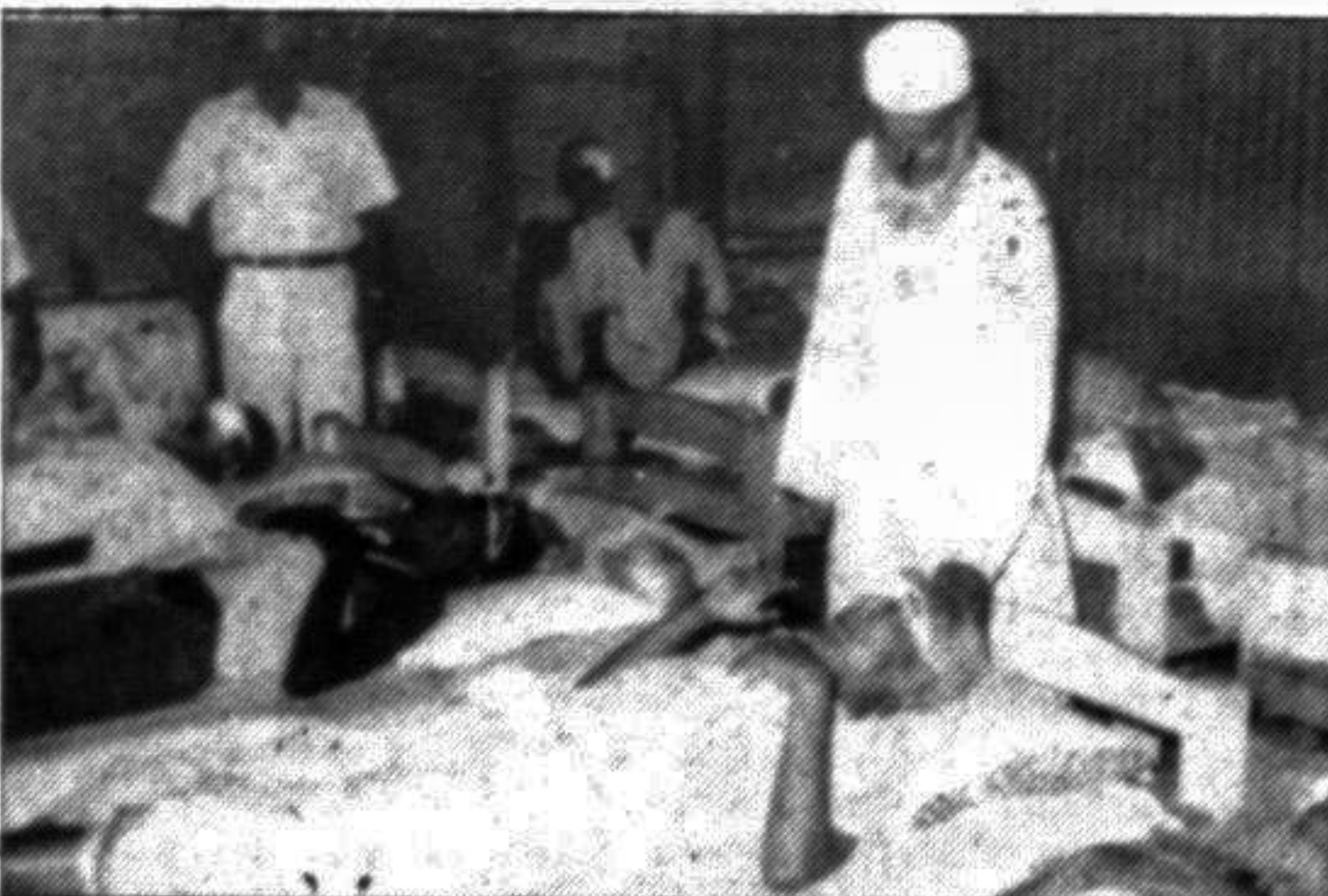
SHERPUR: Local Rotary Club arranged an eye-camp here recently in which 1500 patients were treated.

Villagers told this correspondent that the medicine are not available in the market. Further the price is higher than the fixed rate, they alleged.