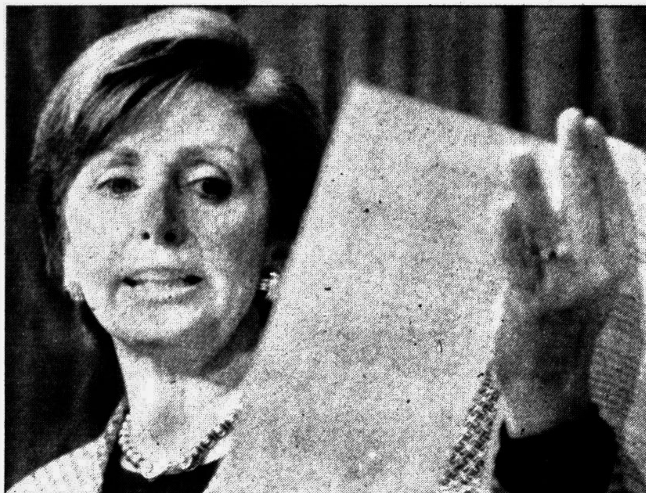
US Congresswoman Nancy Pelosi, D-Calif, describes during a Capitol Hill press conference in Washington, on Wednesday sections of her bill sanctioning China for violating US copyrights. Pelosi is urging US President Bill Clinton to pressure China to live up to its agreement to protect US software.

gotiating table with China to discuss the dispute. The plan to announce sanctions comes amid efforts by the Clinton administration to defuse congressional opposition to unconditional renewal of China's Most Favored Nation (MFN) trade status.