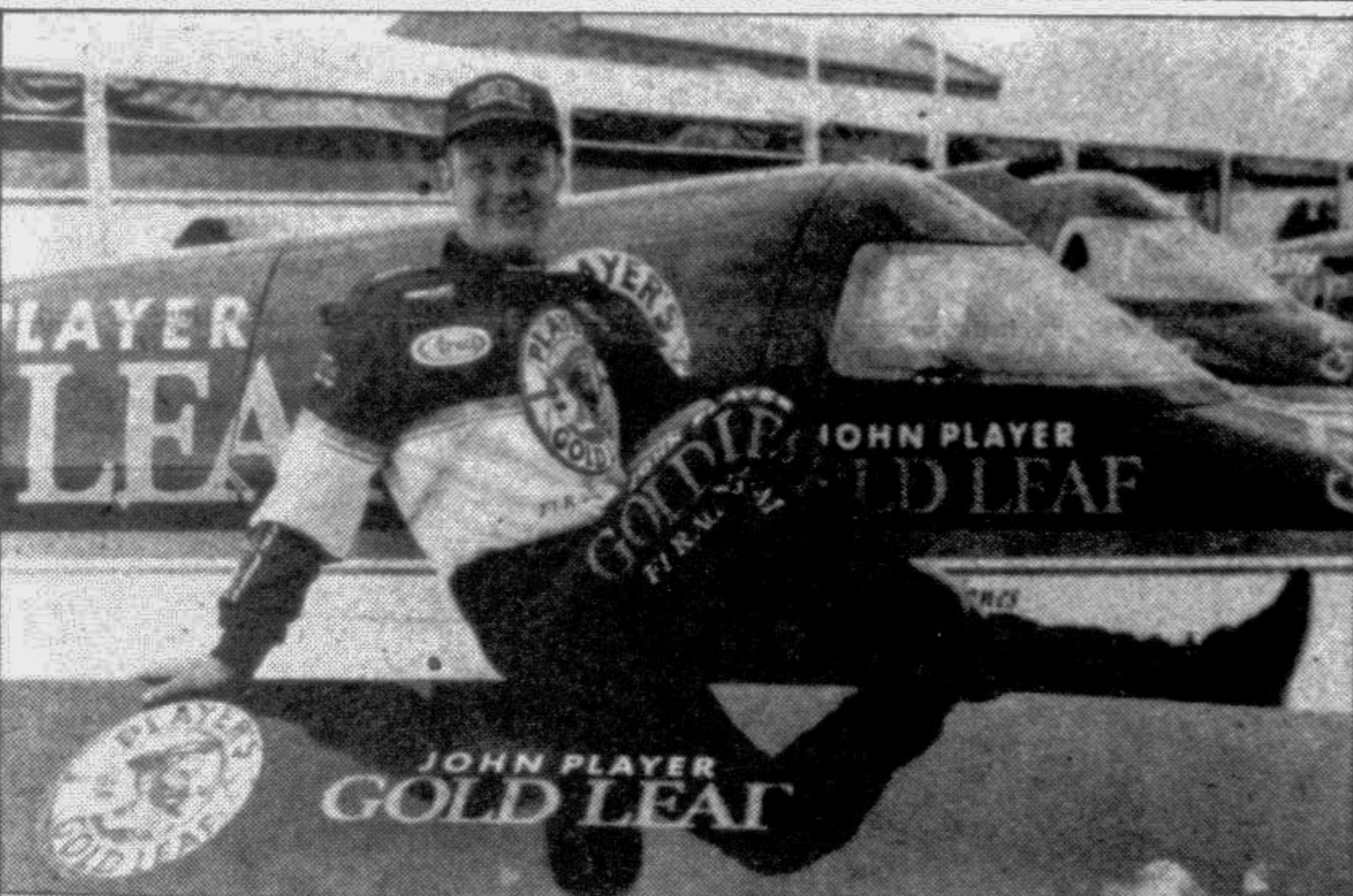
Jon Jones three-time Formula One powerboat world champion.

In reply, the strong Khulna outfit posted the victory 82/3 in only 18 overs with their Tuhin duo scoring 26 and 20 respectively.