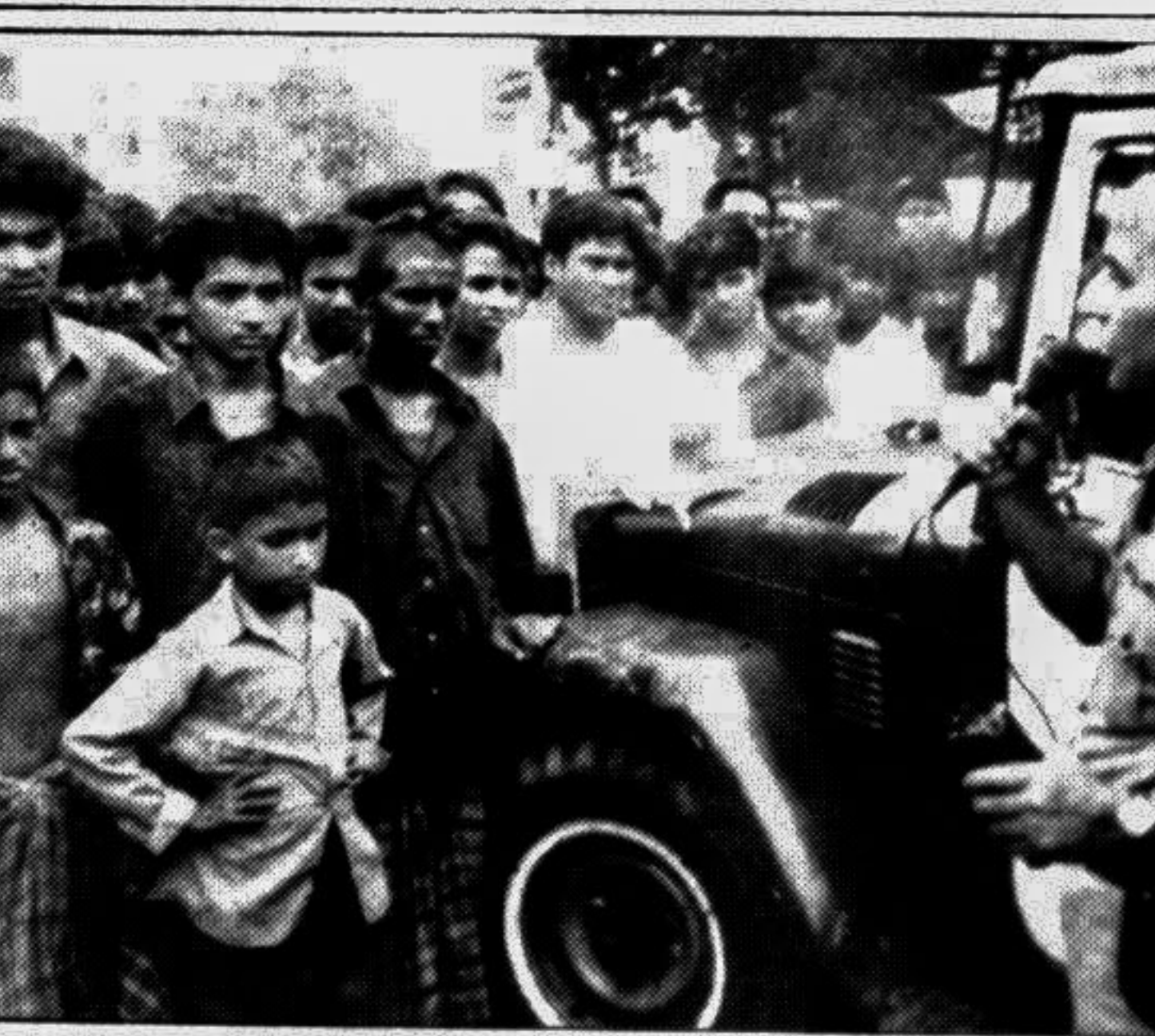
The Officer-in-Charge of Gulshan Thana urging the people to help recover illegal arms during a mass contact programme near the Mahakhali bazaar yesterday.