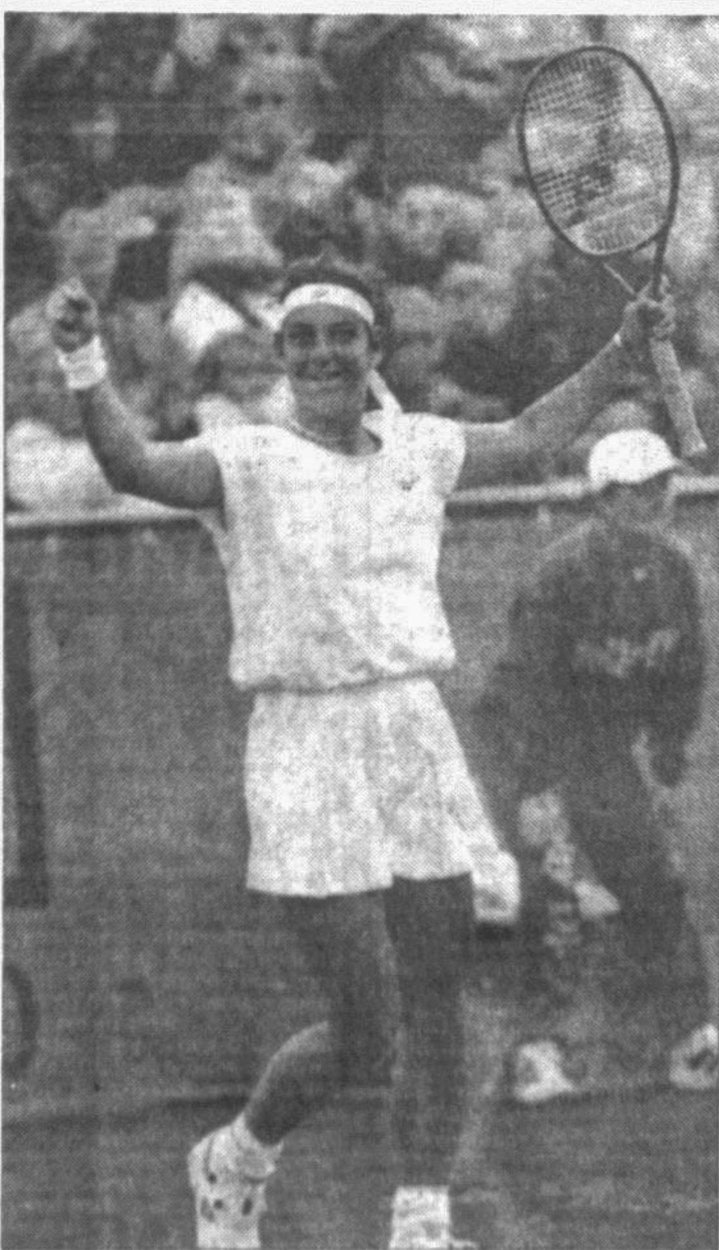
Arantxa Sanchez-Vicario of Spain exults after overcoming compatriot Conchita Martinez 4-6, 7-6, 6-0 in the final of the Hamburg Cup in Hamburg, Germany on May 5.

Dosedel took him prize money of 57,000 dollars for winning the tournament.