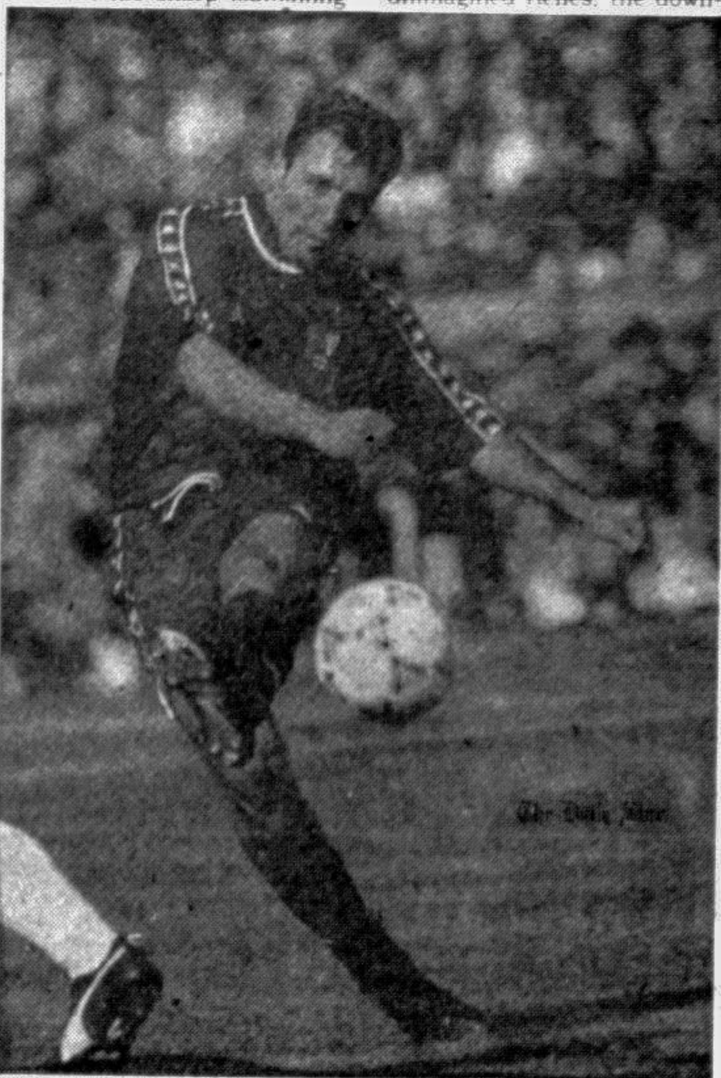
HRISTO STOICHKOV ... his devastating left foot can answer all of Bulgaria's problems.

brain and lethal finishing in front of goal have brought him unimaginable riches, the down-