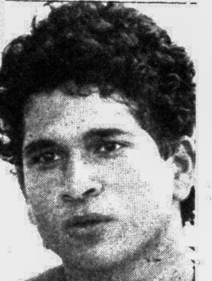
TENDULKAR... 108 N.O.

Javagal Srinath and Anil Kumble, India's two world class bowlers, also used the