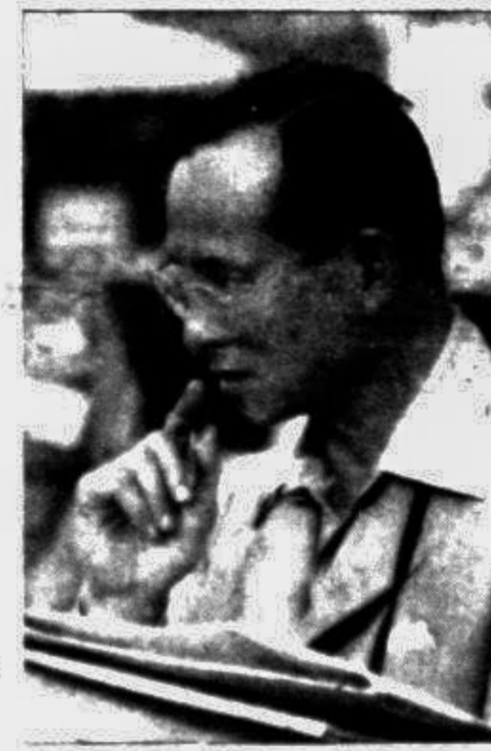
Photo exhibition on King Bhumibol May 9

This will ensure confidence in the validity of the election process and set the stage for reasonable campaigning by all political parties and persons, he added.