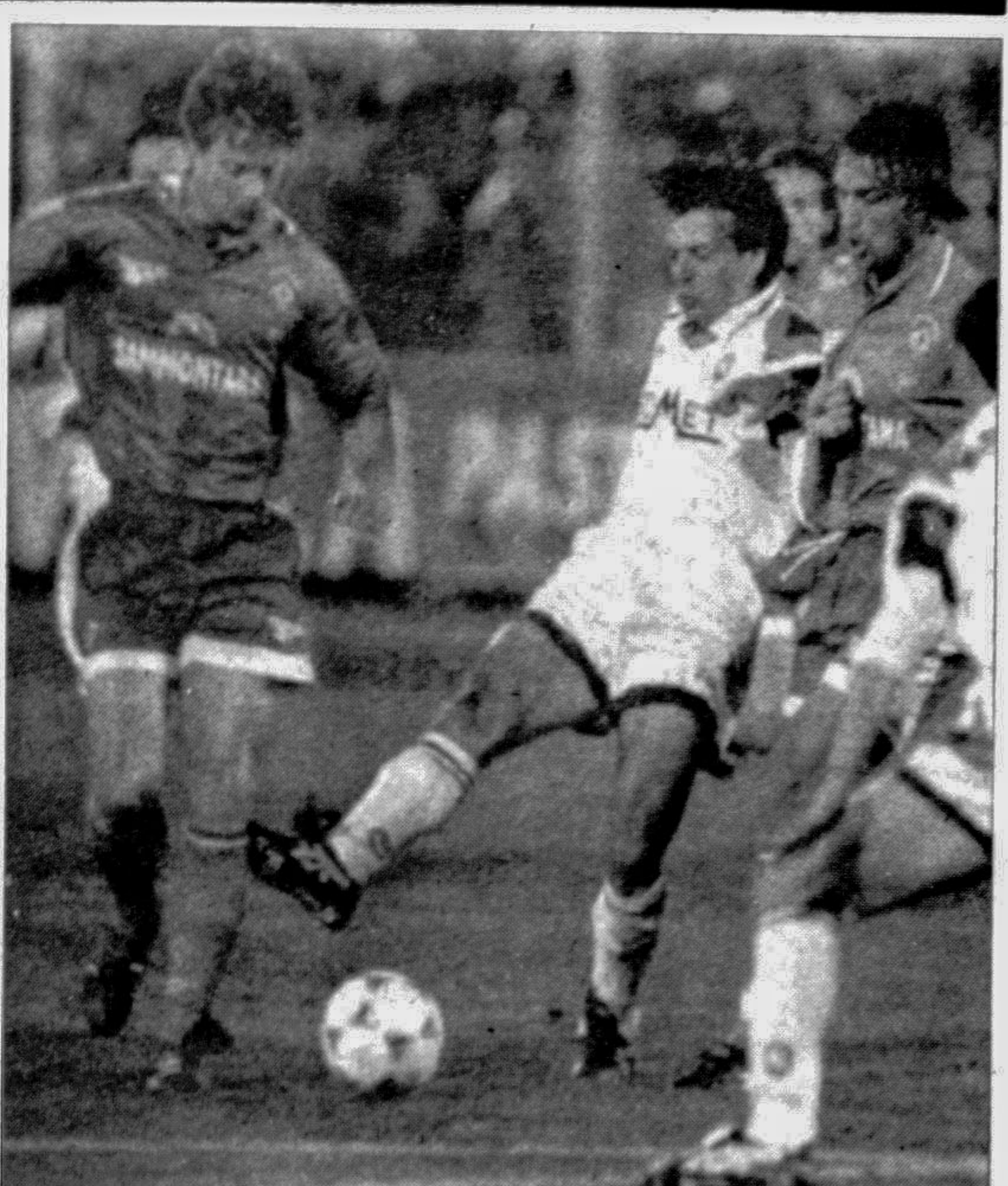
Fiorentina's Stefan Schwarz (L) trying to receive a pass from his fellow Argentine striker Gabriel Batistuta (R) while an unidentified Atalanta booter (C) seen resisting them during their World Cup final first leg encounter in Florence on Thursday. Fiorentina won the match 1-0.