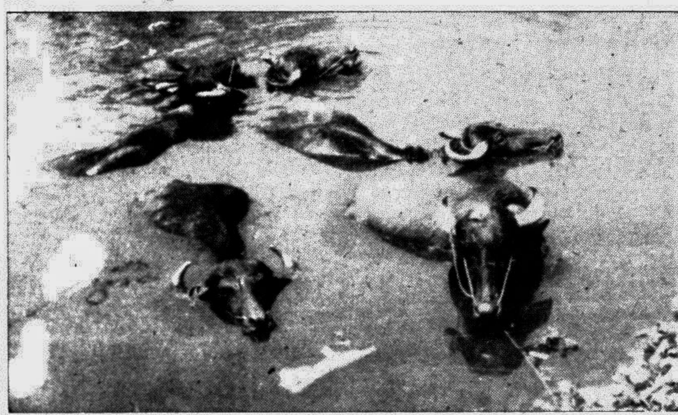
NATORE: The prevailing drought and heat situation has forced many cattle like these buffaloes to cool down in water wherever available, even if much away from the field.

gone out of order in Lalpur thana, out of 1,844 STWs 54 have gone out of order in Borrairang thana, out of 930 STWs, 36 have gone out of order in Bagatipara and out of 1,294 STWs about 74 have gone out of order in Gurudashpur thana. There are at least 3,620 "lara" pumps throughout the district. Of them only 111 pumps are remaining out of order. But, unofficial sources informed this correspondent that about 40 to 50 per cent of shallow and tara pumps have been choked up. The miseries of the people became further acute due to erratic supply of electricity. People living in rural areas are the worst sufferers. Demand for green coconut and have increased. According to Department of Public Health Engineering (DPHE), underground water level has fallen by 6 to 8 feet in this region during the last one month. Prayers are being offered at different mosques and temples for rain.