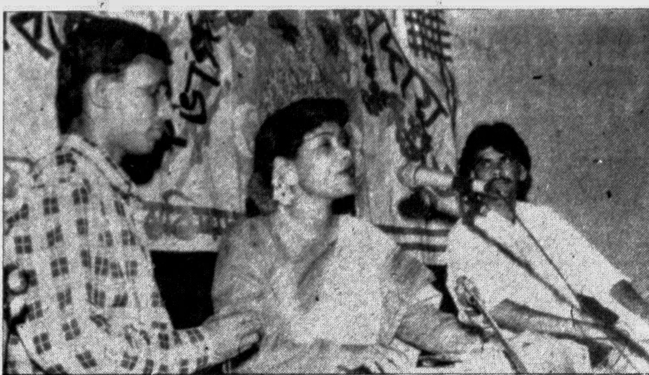
RAJSHAHI UNIVERSITY: A student of Sociology Department rendering songs at the freshers' reception ceremony of the department recently.