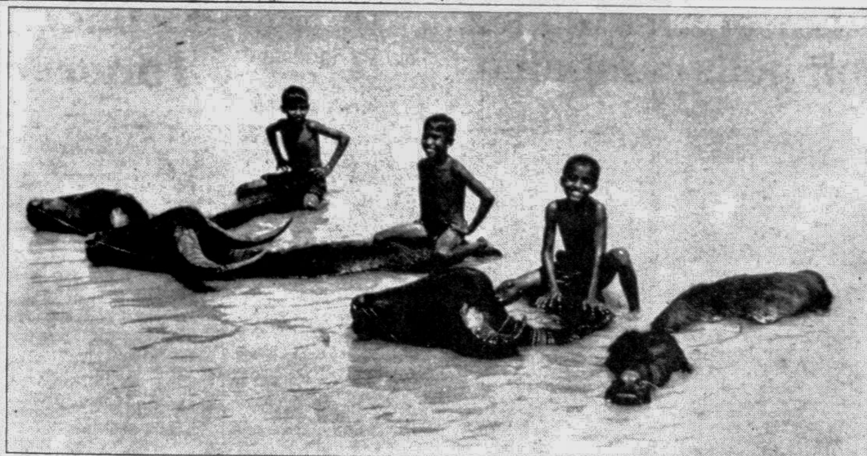
Driven by sweltering heat, these buffaloes take a dip in water while the kids ride on their back.