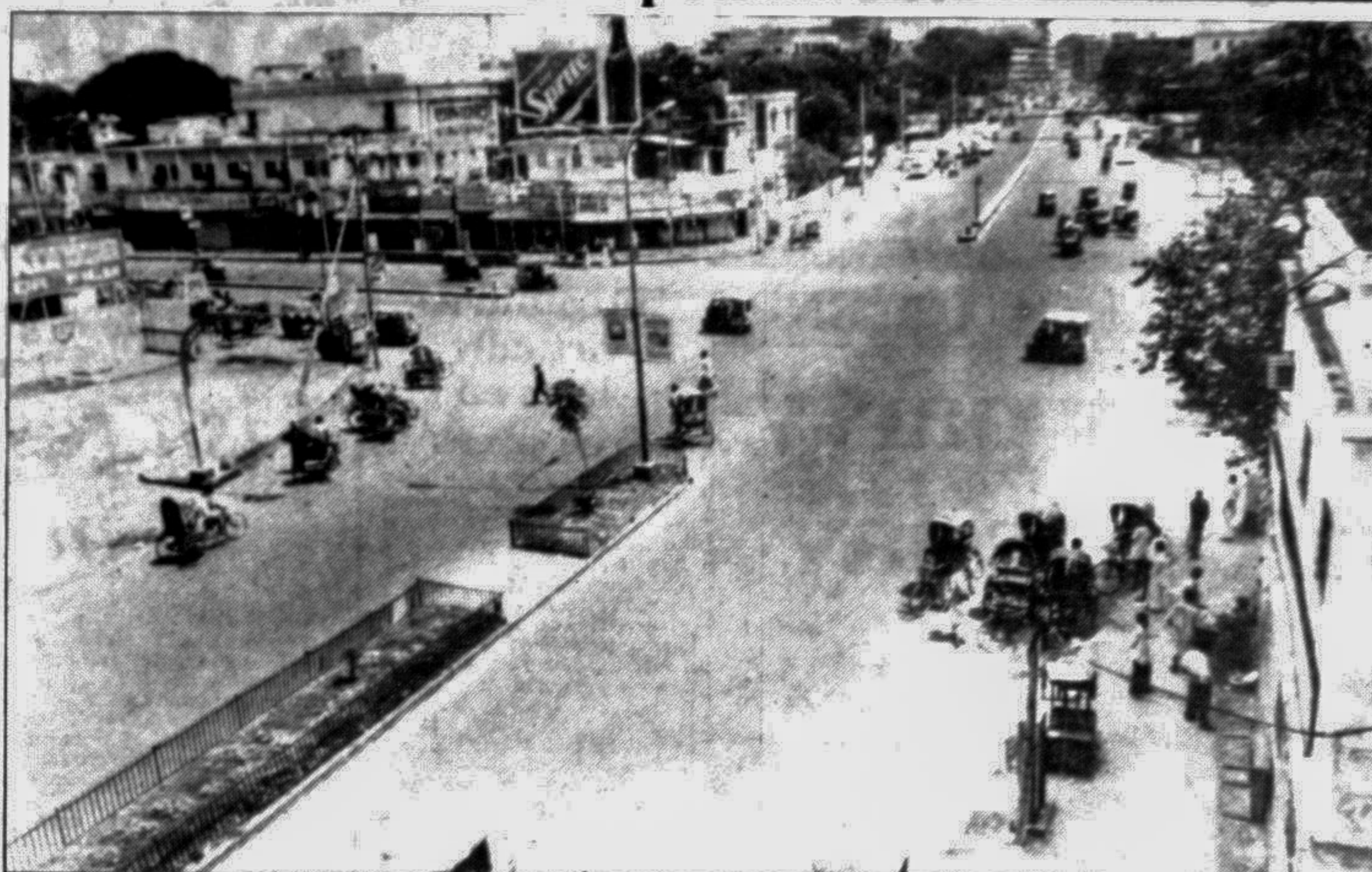
The city was almost well-deserted as the number of traffic was scanty on the post-Eid holiday yesterday.

Workers Party yesterday called upon all of its district committees, to finalise and send the names of party candidates for the ensuing election by Monday, reports UNB. The candidates will be given a briefing at a meeting at the party's central office at 10 am on May 8. All party candidates have been advised to attend the meeting with two copies of passport-sized photograph and biographical data.