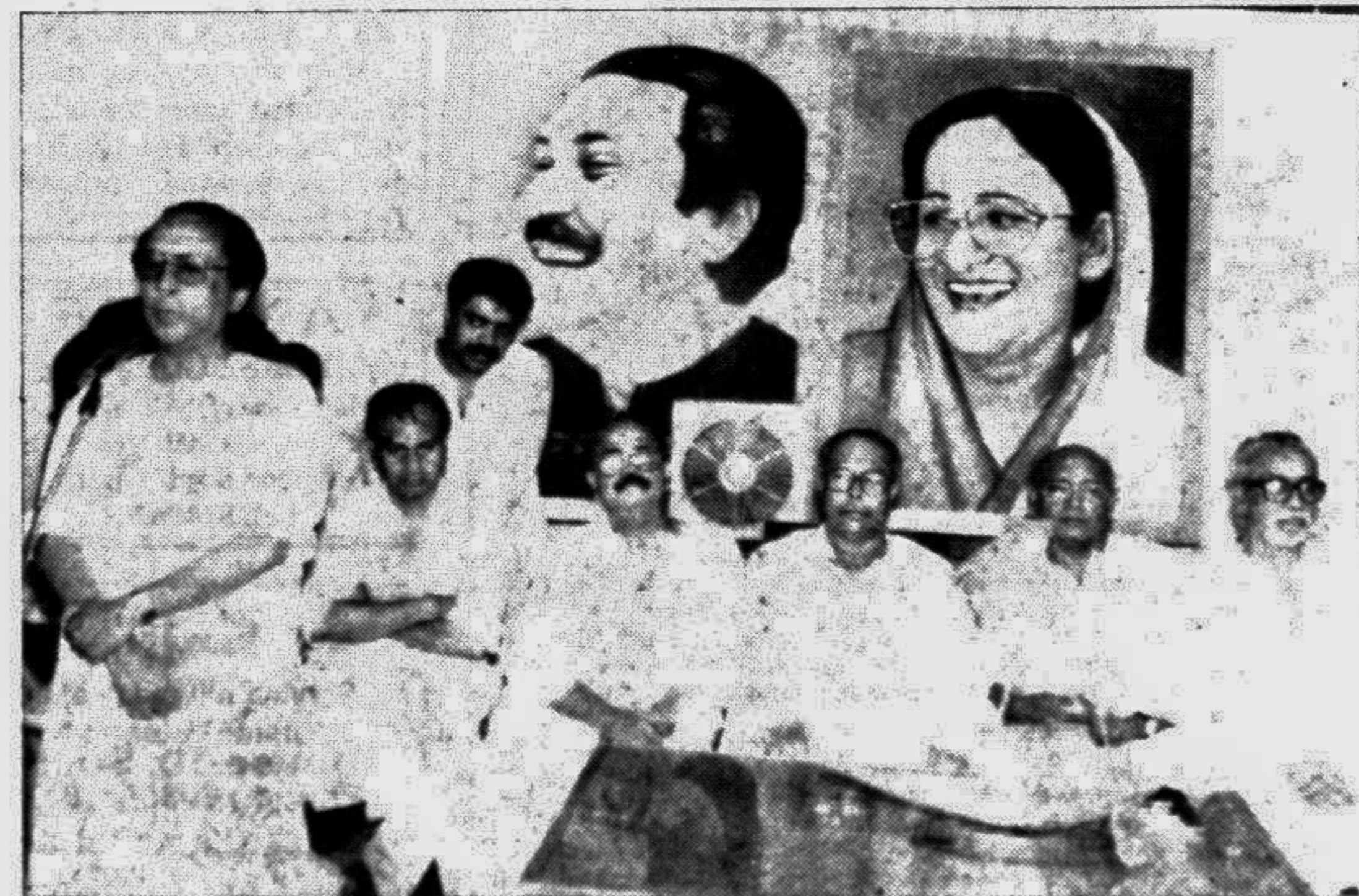
AL General Secretary Zillur Rahman addressing party workers after opening the party's election office at Road No 12 in Dhanmondi yesterday.