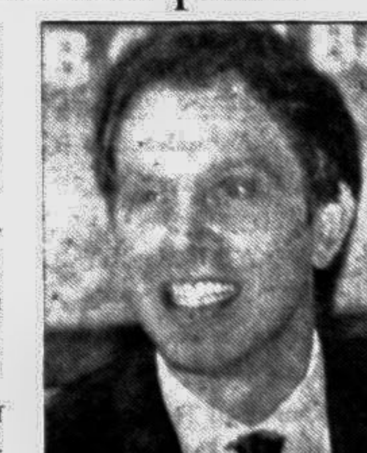
Labour leader Tony Blair

But Labour leader Tony Blair hailed his party's 17 per cent lead over the ruling party as "spectacularly good results."