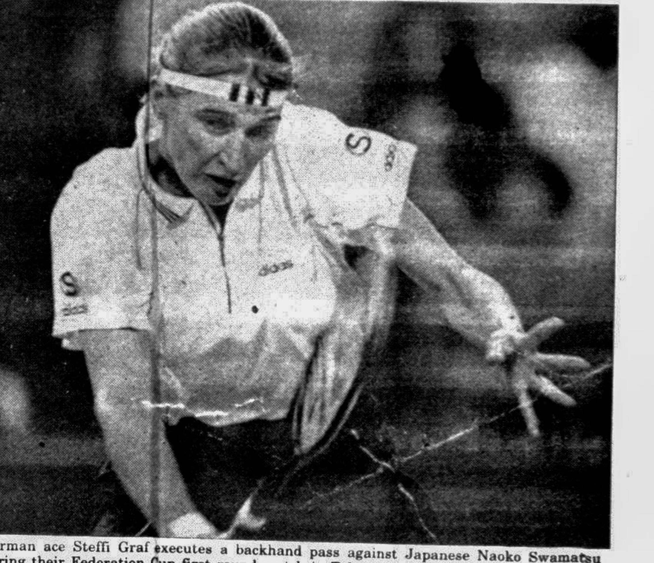
German ace Steffi Graf executes a backhand pass against Japanese Naoko Swamatsu during their Federation Cup first round match in Tokyo on Apr 27. Graf easily won 6-1, 6-3.

mere 20 minutes, but it was the beginning of the long, grueling three-hour, 24-minute affair, in which a total of 11 games went against serves with Graf converting six out of 23 breakpoints and Date winning five of 19 chances.